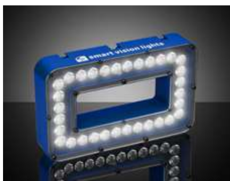
Smart Vision Lights Compact Ring Lights