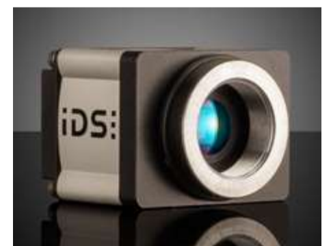
IDS Imaging uEye+ FA IP65/67 PoE Cameras