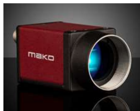
Allied Vision Mako Power over Ethernet (PoE) Cameras