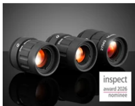
Edmund Optics E Series Fixed Focal Length Lenses