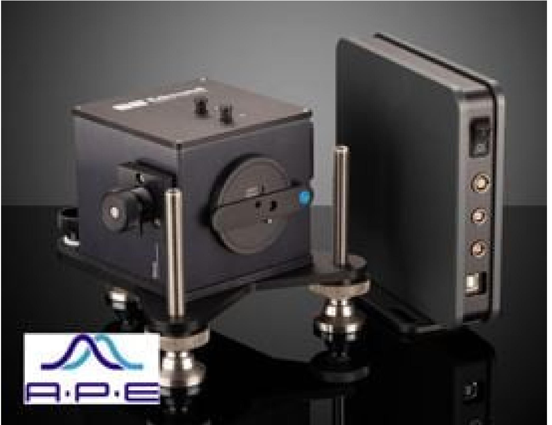
#11-760 Edmund Optics TPA Ultrafast Autocorrelator by APE (700-1100nm)