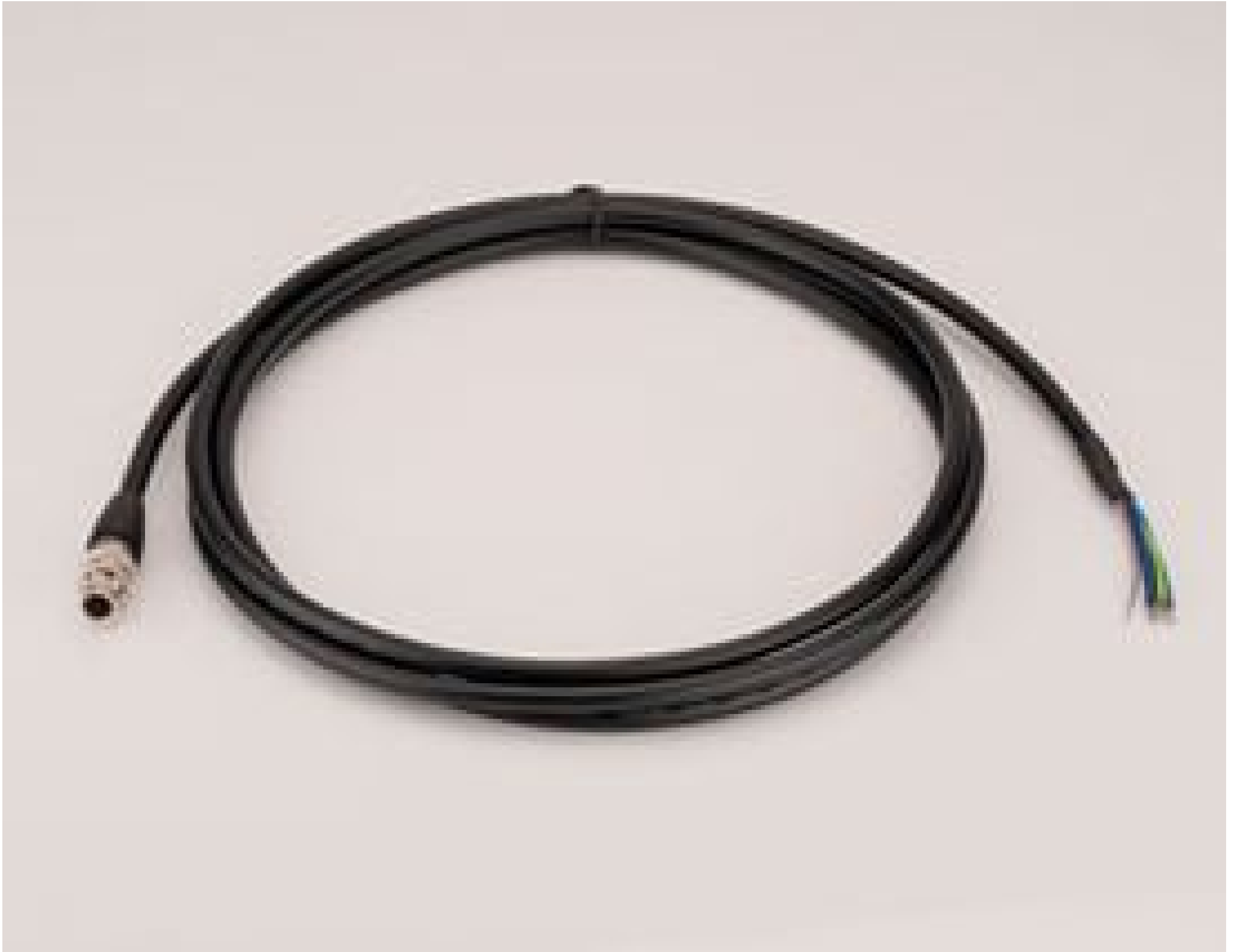
#89-406: Trigger Cable Kit for PL-D Cameras with end unterminated