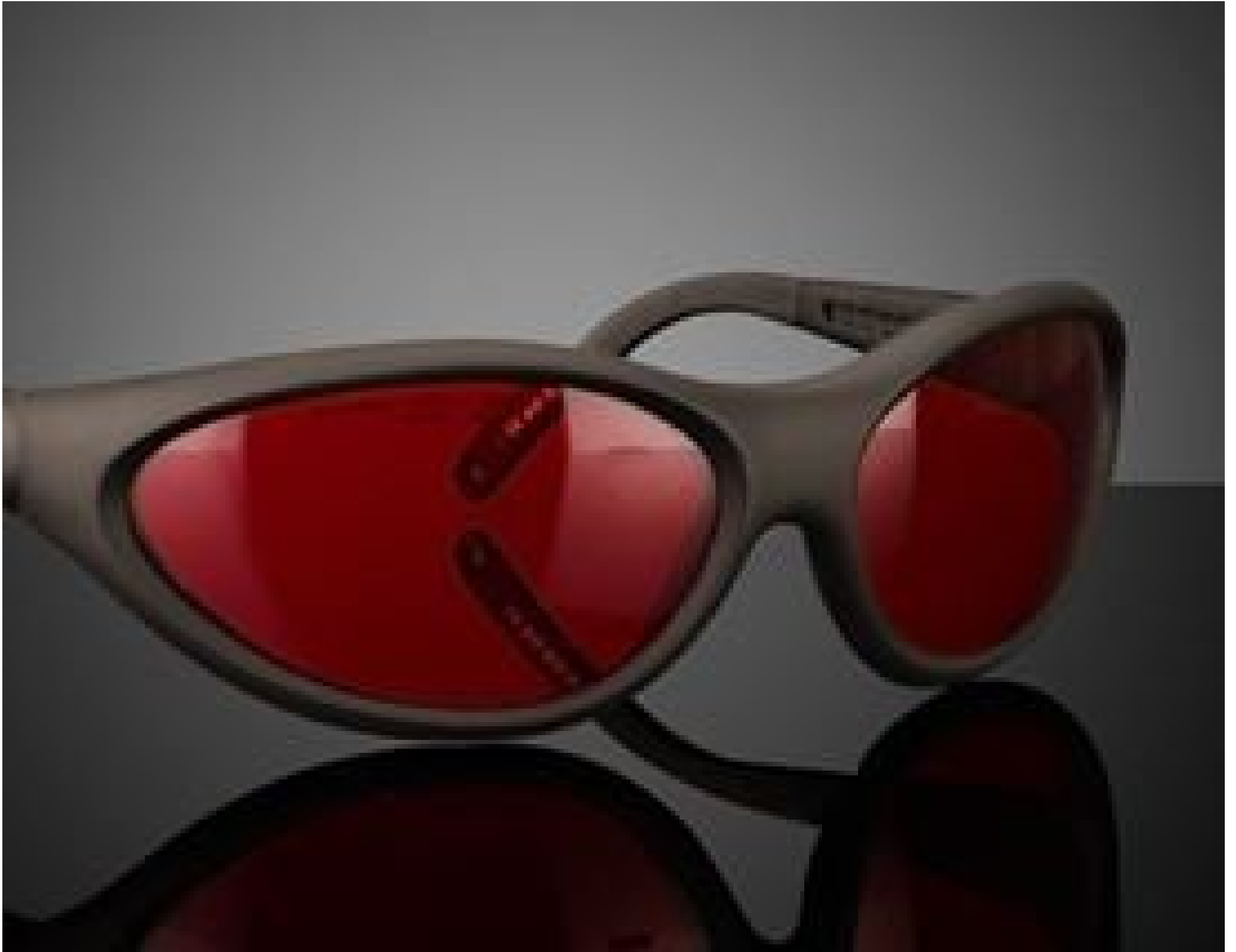
Image represents frame style only. Filter color will vary by product specification.