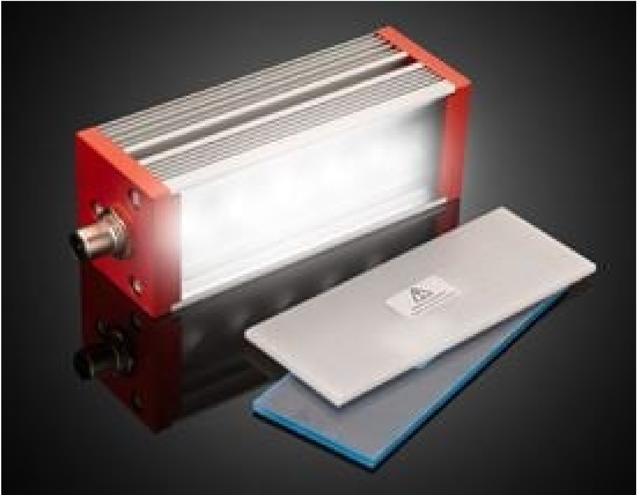
Effilux SWIR LED Bar Lights