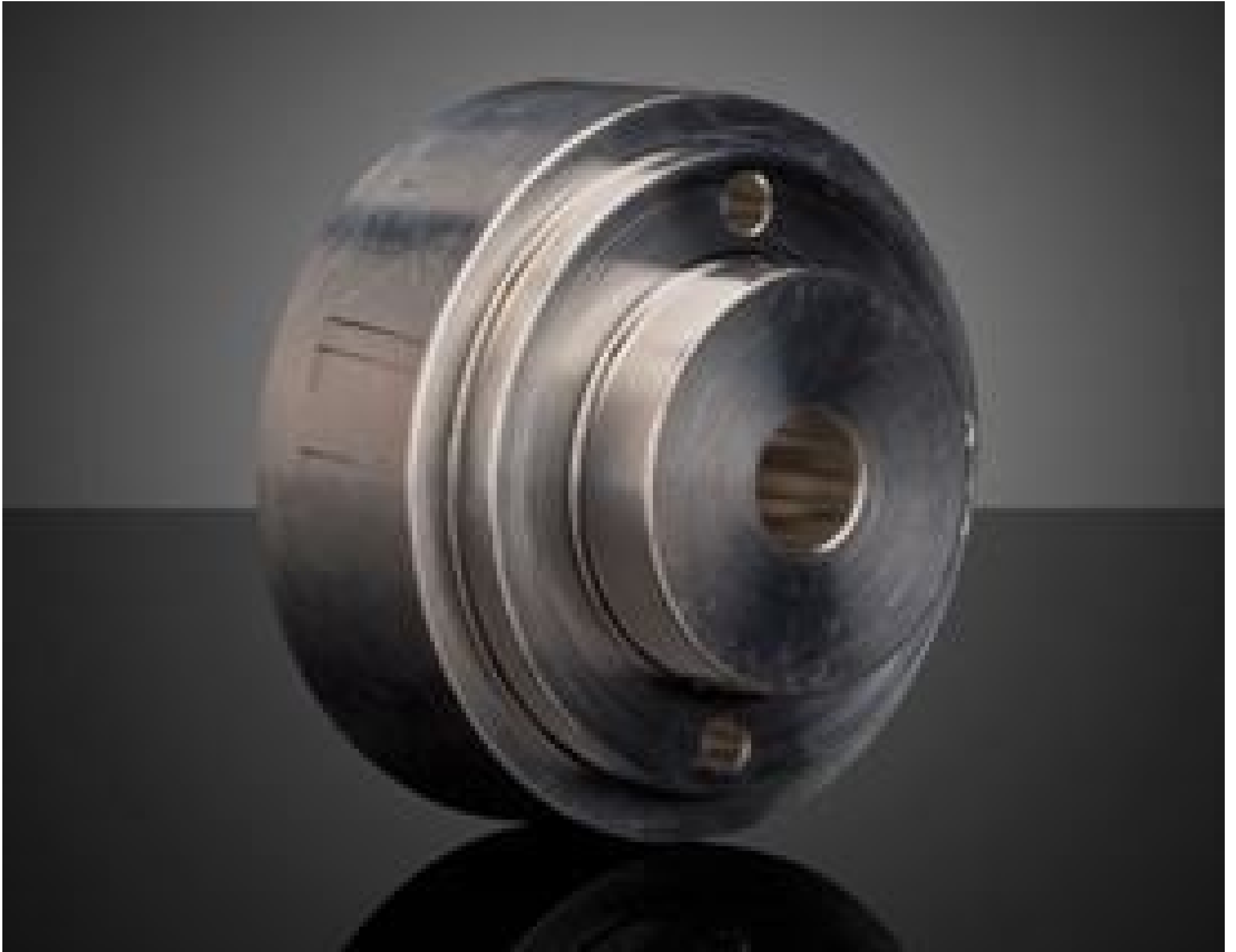
SugarCUBE™ Light Guide Adapter - 5mm (#13-537)