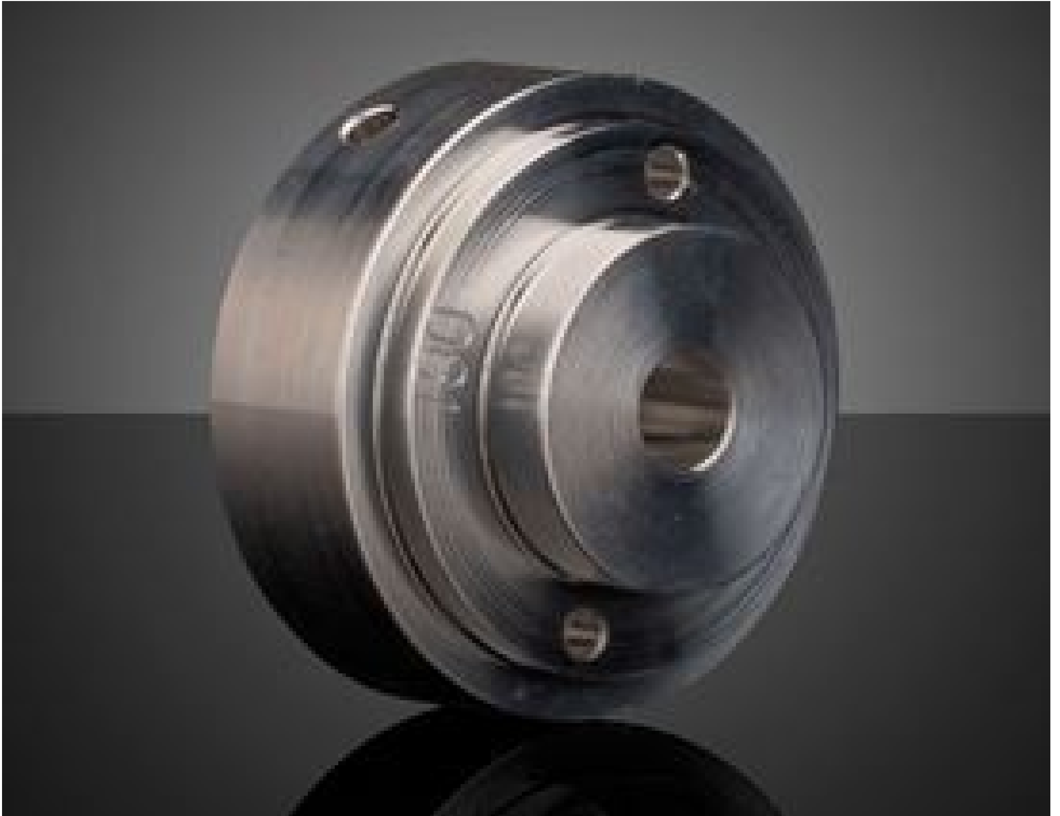
SugarCUBE™ Light Guide Adapter - 3mm (#13-536)