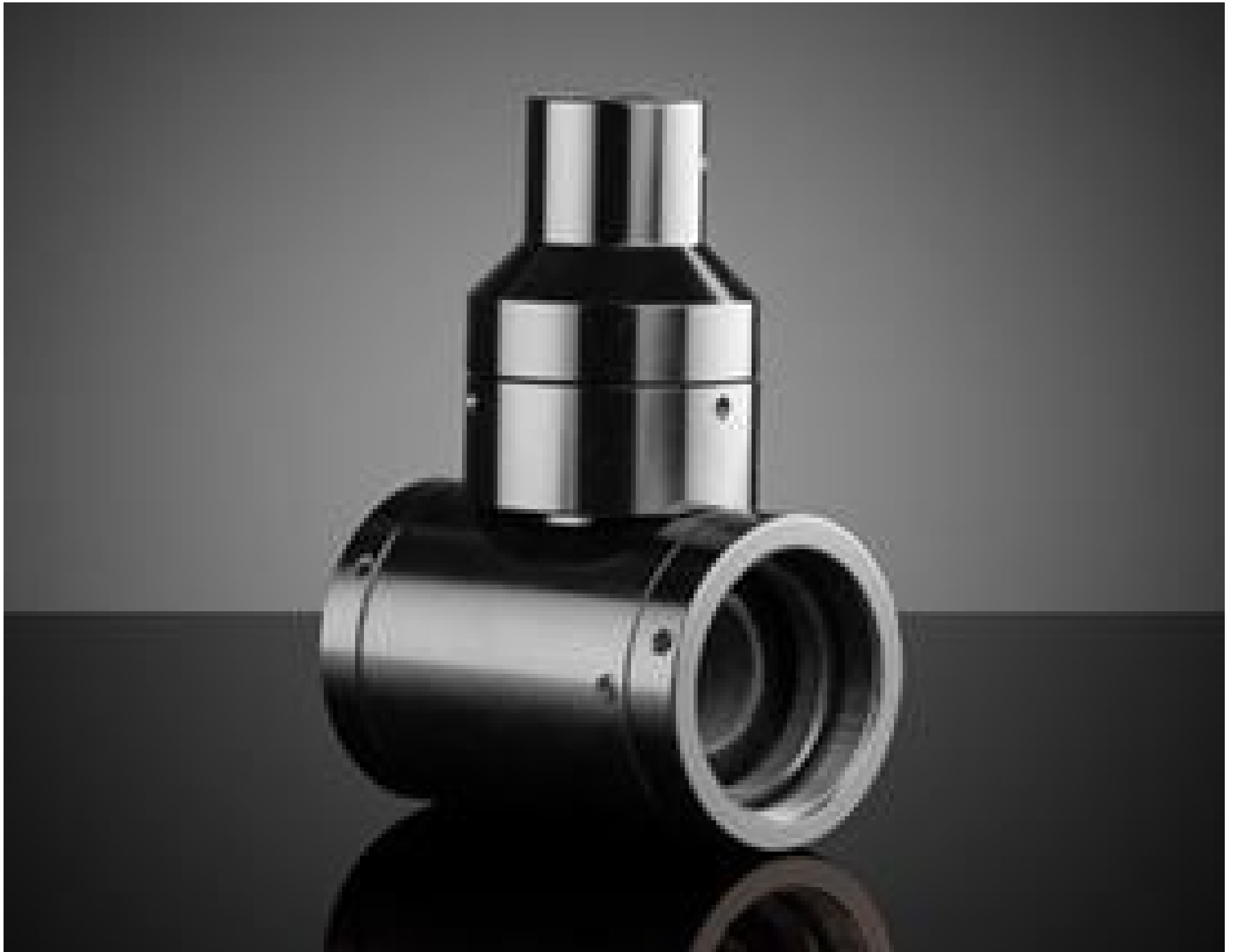
Standard In-Line Attachment (Optimized at 10X+), InfiniTube

See More by Infinity Photo-Optical Company