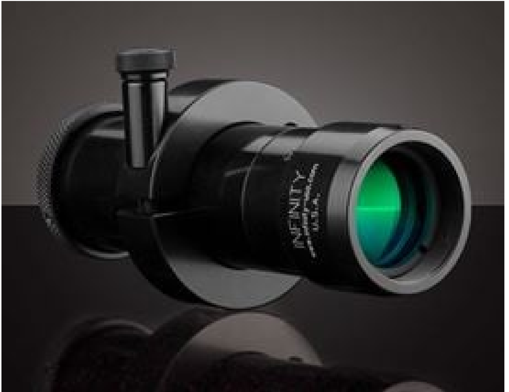
Standard (with no In-Line Attachment), InfiniTube, #56-125

See More by Infinity Photo-Optical Company