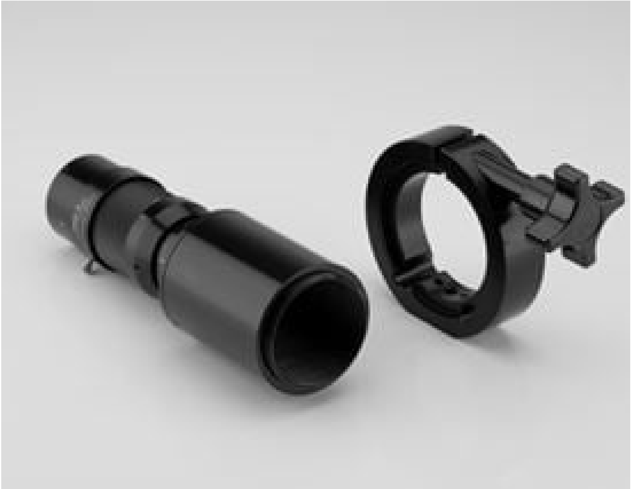
#86-890: ST Main Body with Iris, T-Mount, KC VideoMax