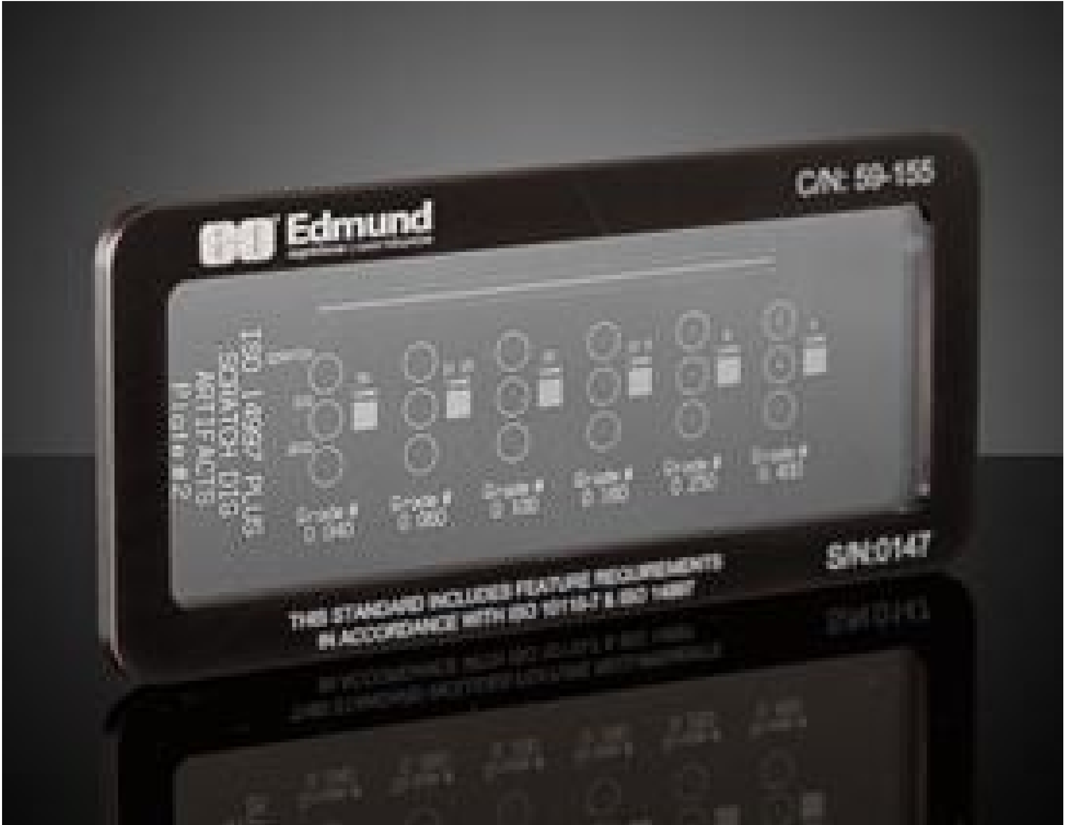
Scratch & Dig Target (2nd Surface Positive), #59-155