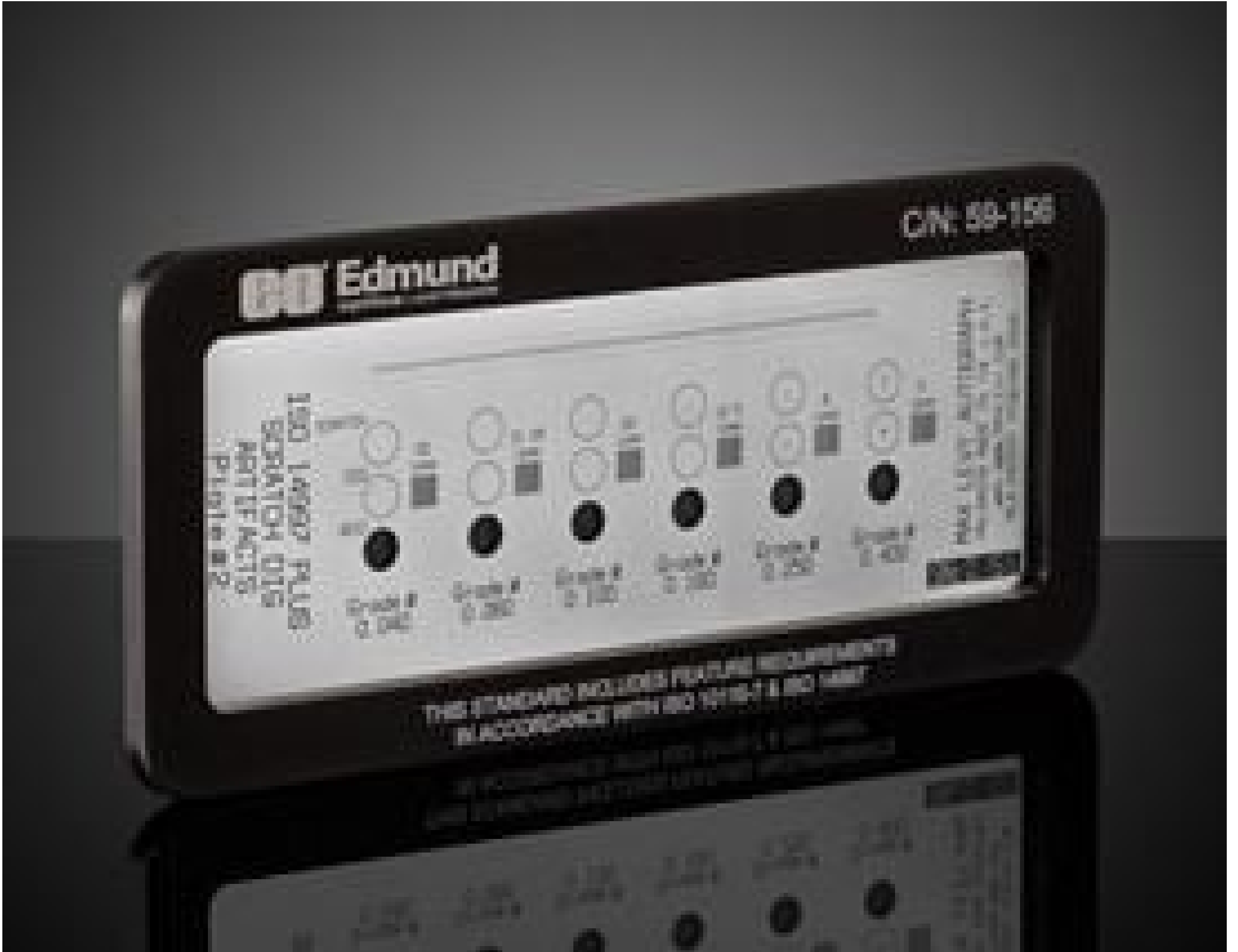
Scratch & Dig Target (1st Surface Negative), #59-156