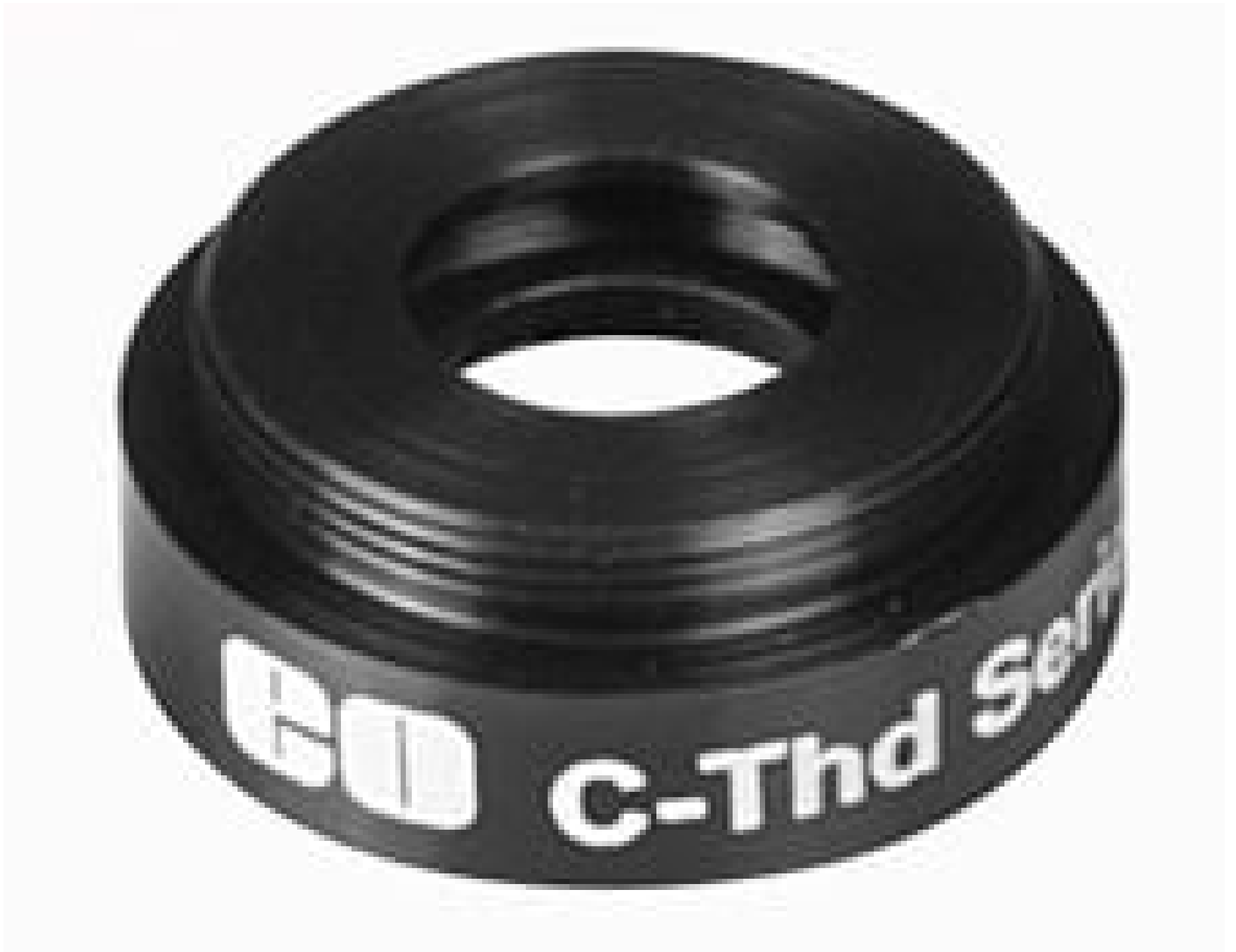
C-Mount to TO-8 Detector Mount, #58-733