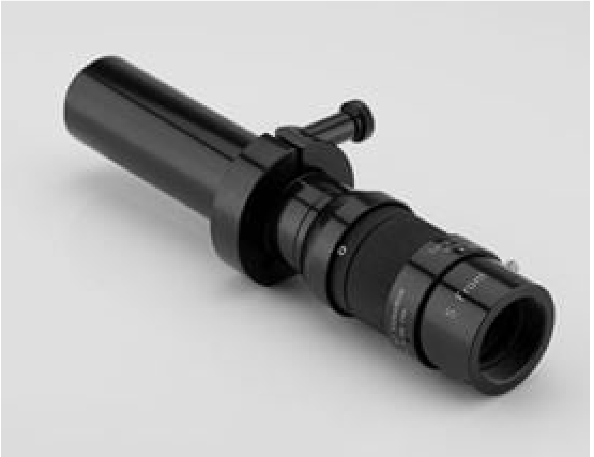
#86-889: S Main Body, C-Mount, KC VideoMax