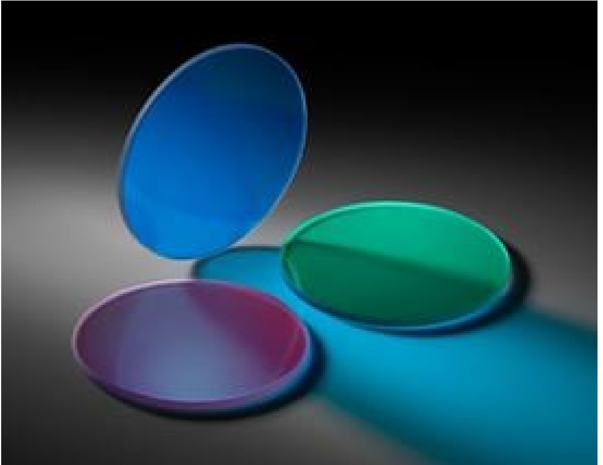
Red, Green, and Blue Dichroic Filter Set