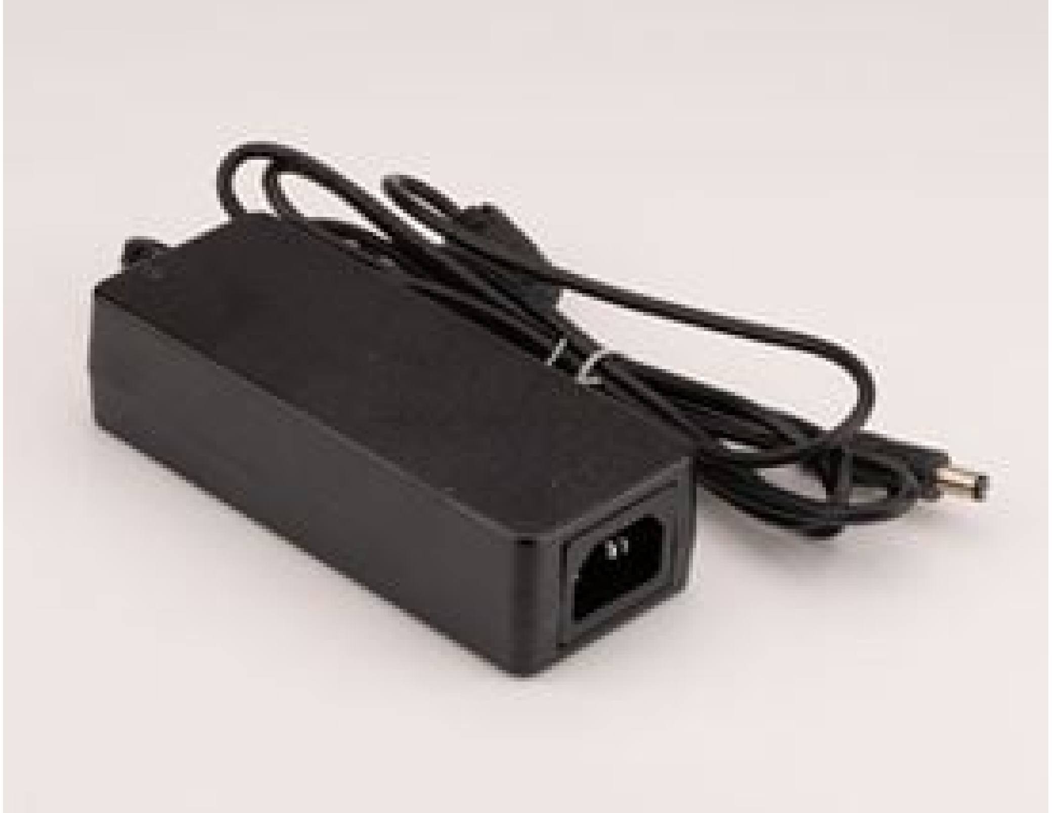
#16-791: Power Supply for SCHOTT VisiLED Ringlights