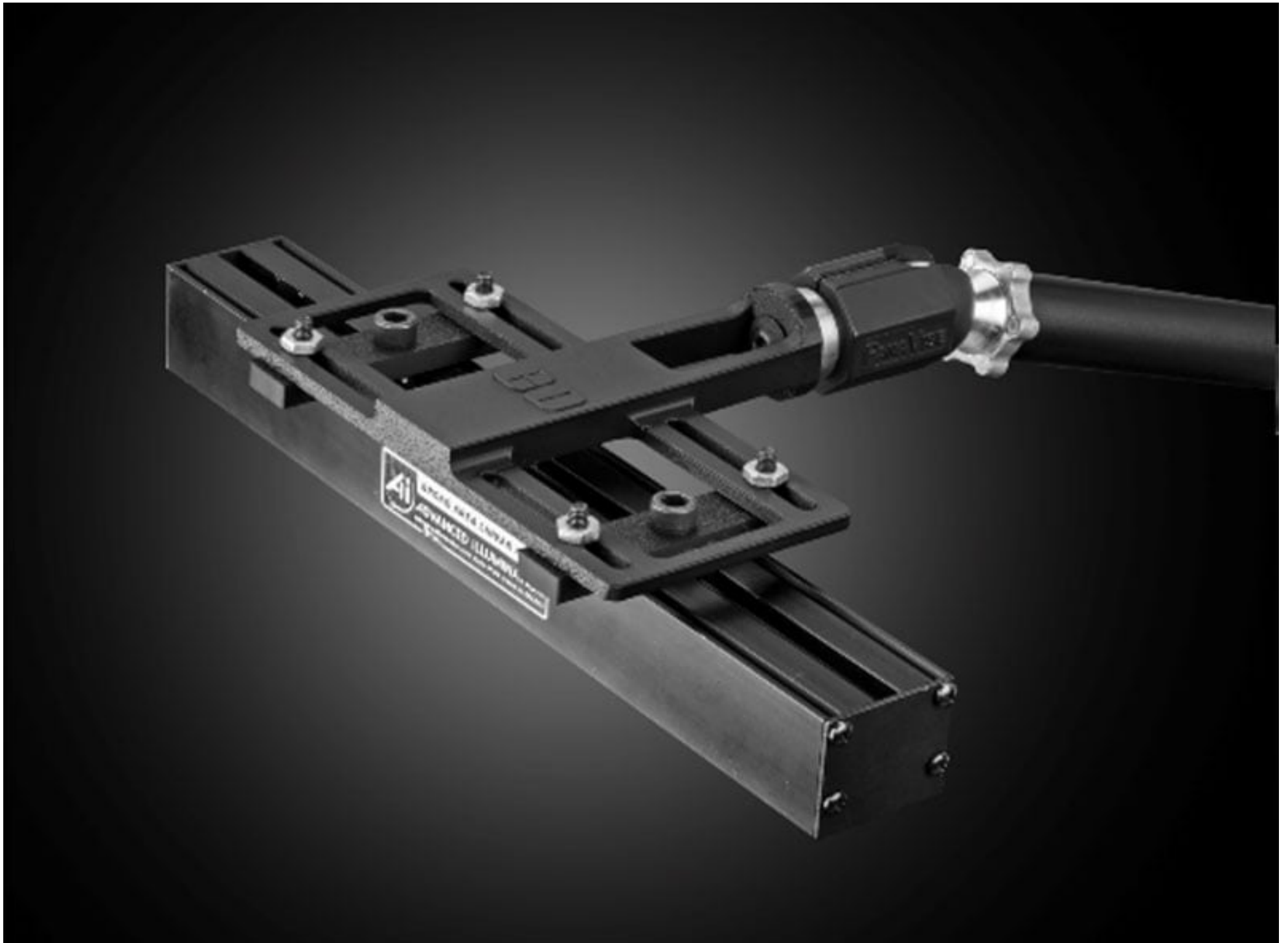
Bar or Line Light Configuration