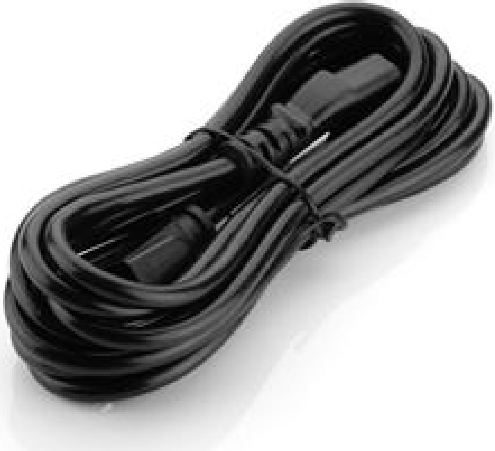
Power Cord for MFC-200 Power Supply (120V)