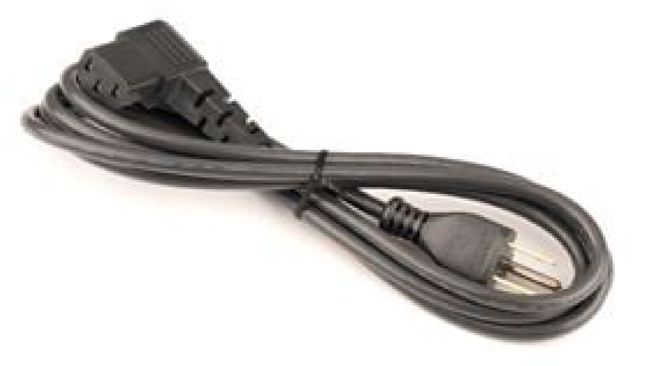
Power Cord for CX43 Microscope (USA) | Olympus UYCP-11