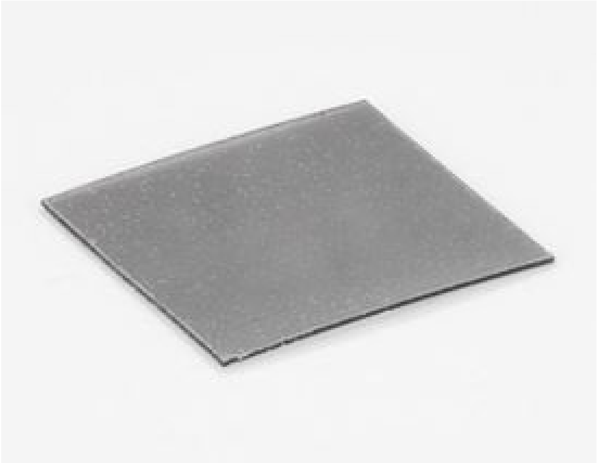
#34-881: Polarizer Accessory for 1 LED Bar Light