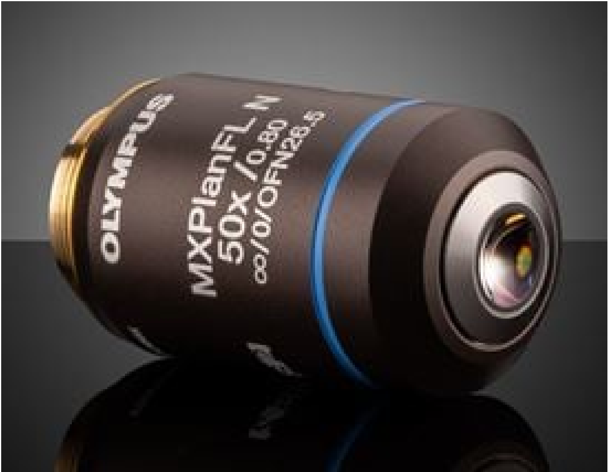
#23-722: Olympus MXPLFLN 50X Objective