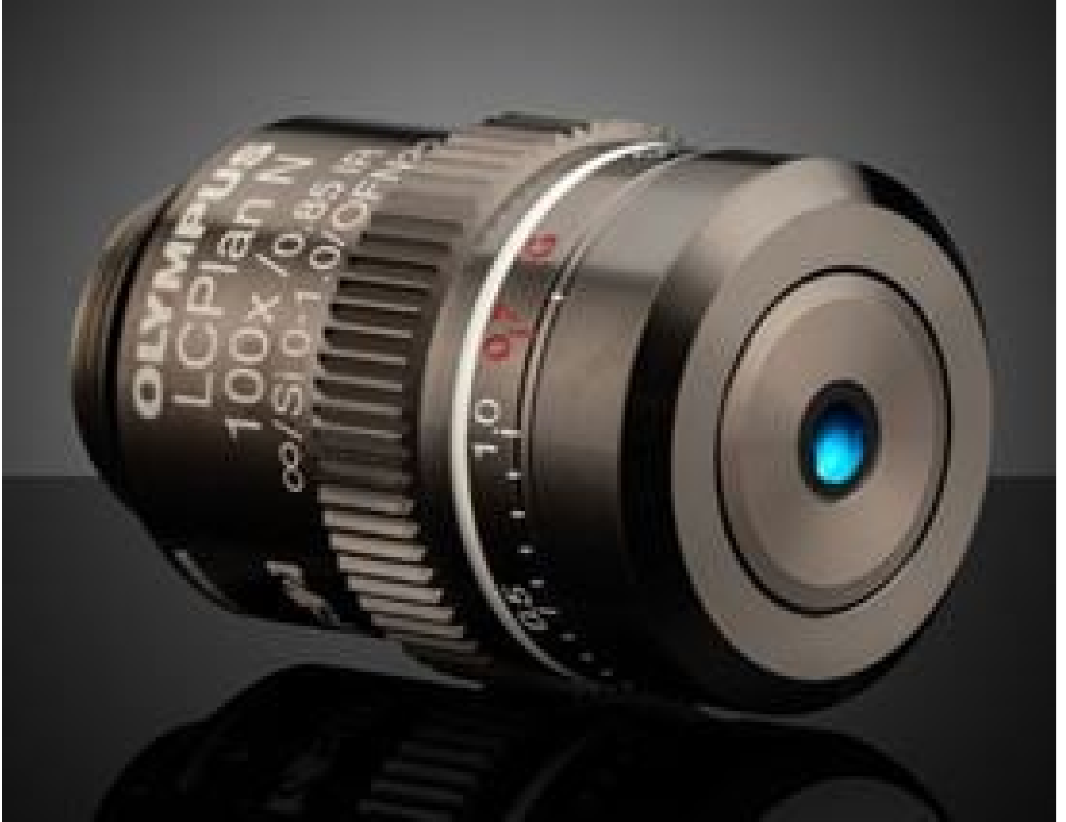
Olympus LCPLN100XIR 100X NIR Objective