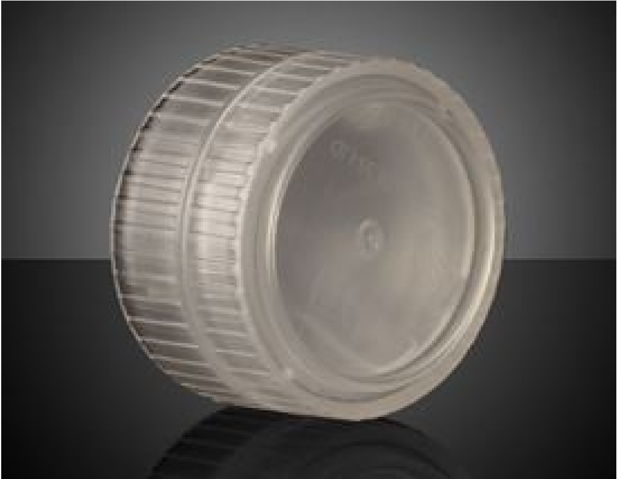
Non-Contact Impact Case for 19.1 Dia. x 6.35mm Thick Optics