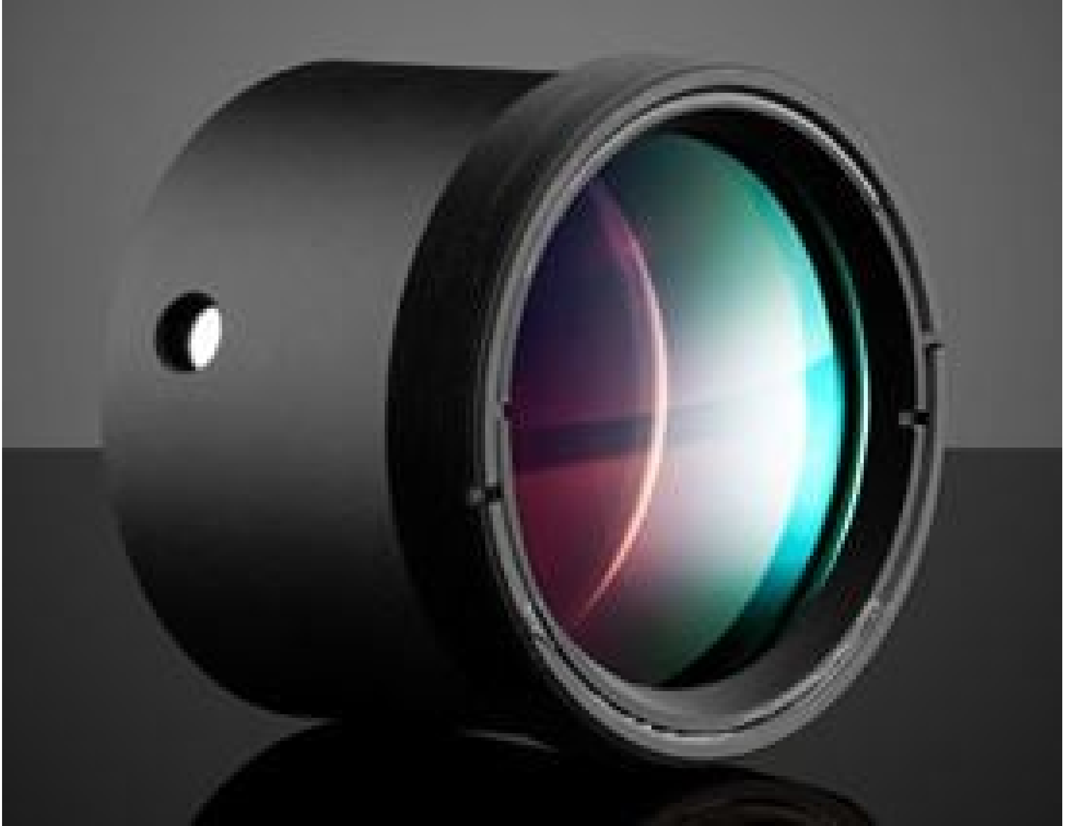
#58-520: Nikon 200mm Tube Lens