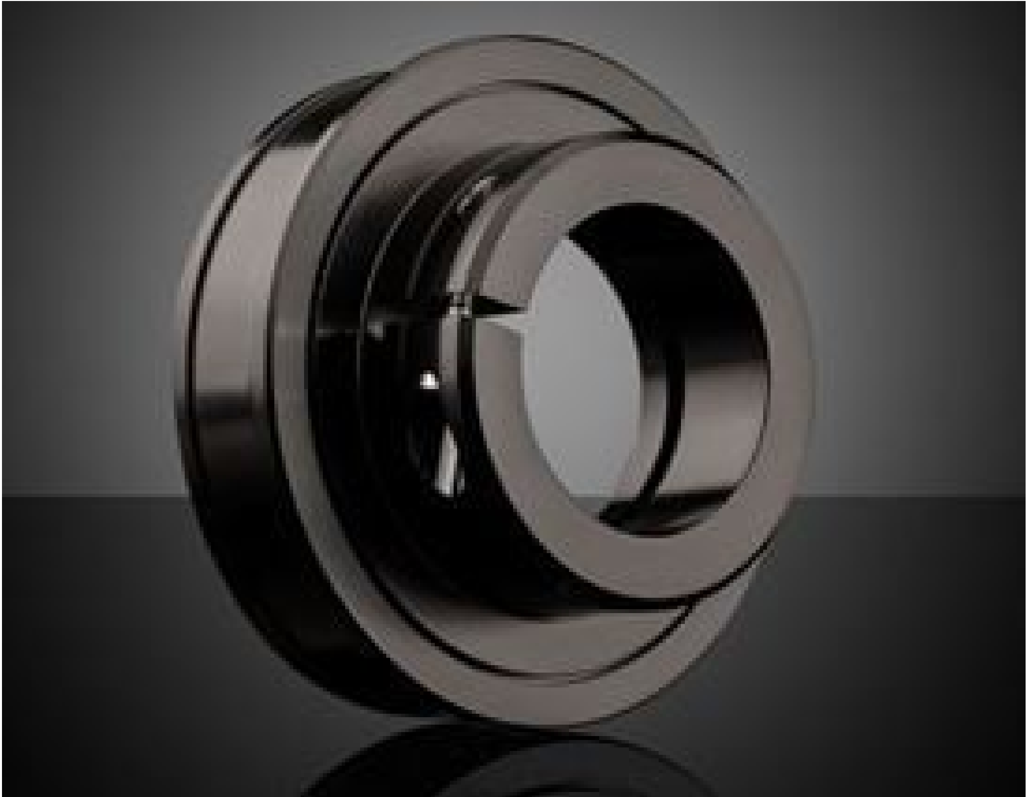
Microscope Stand Mounting Clamp