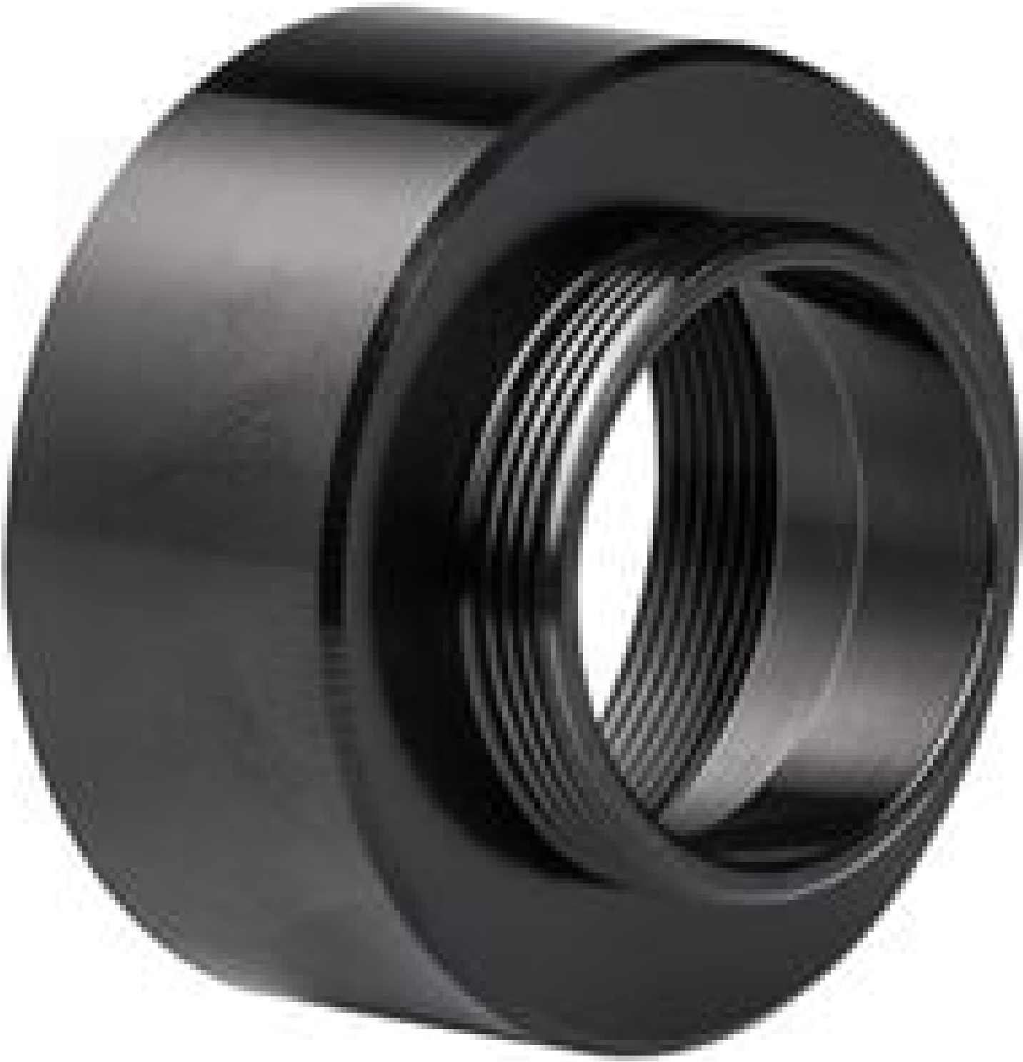
Mitutoyo to RMS Adapter, #58-296