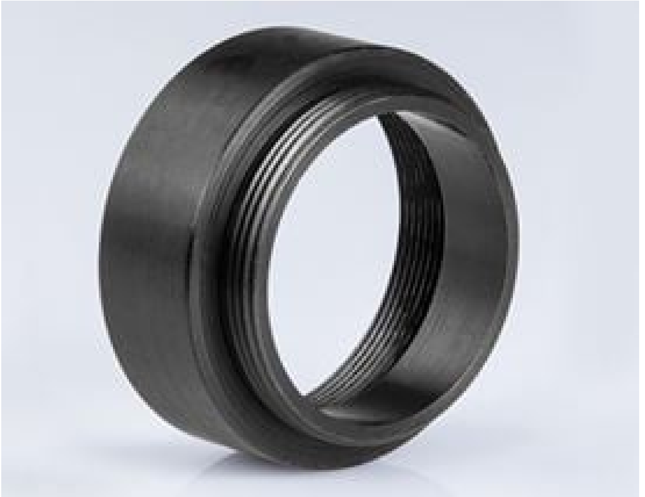
Mitutoyo to C-mount 10mm Adapter, #55-743