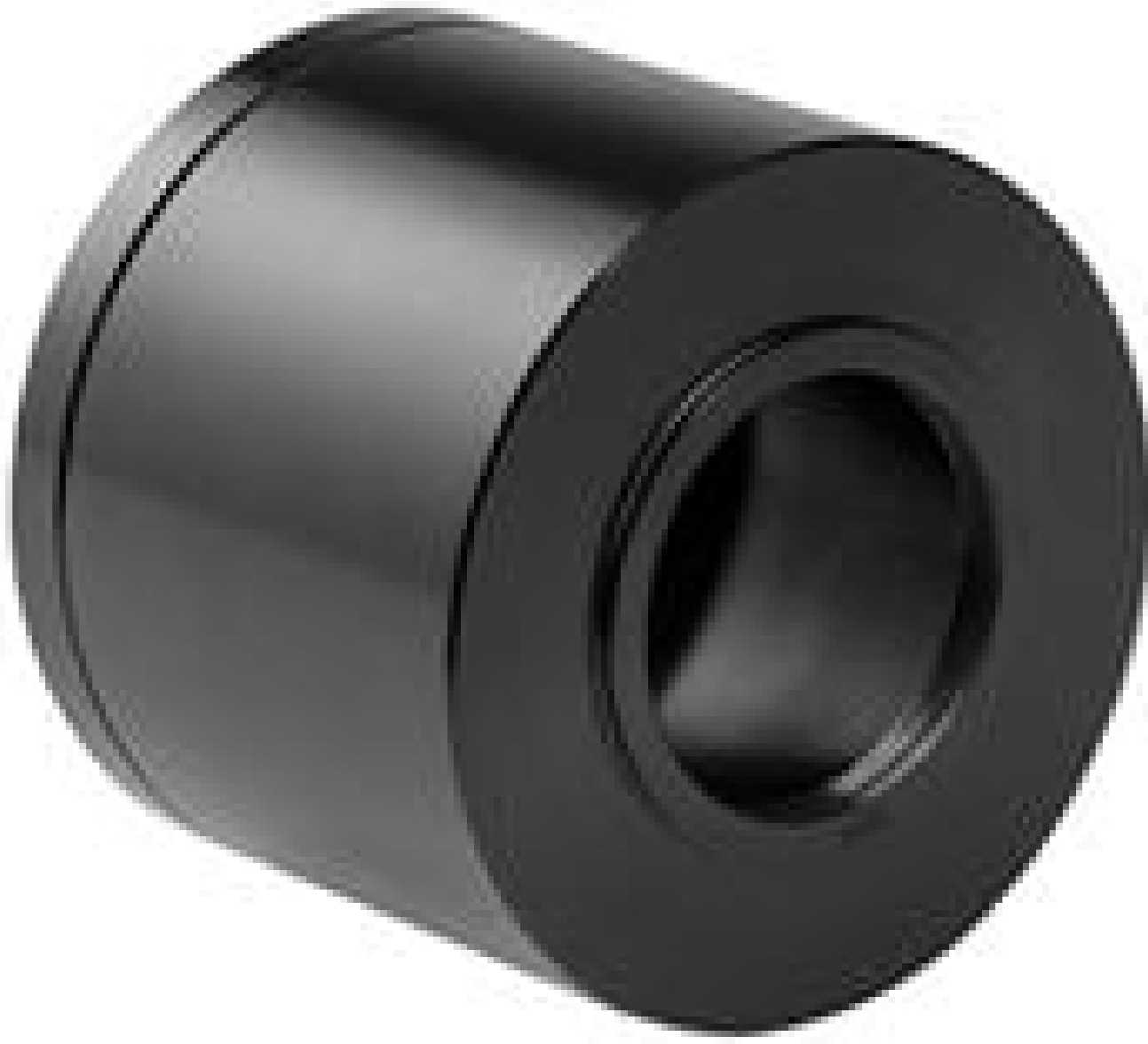
Mitutoyo MT-L/MT-L4 C-Mount Adapter, #66-027