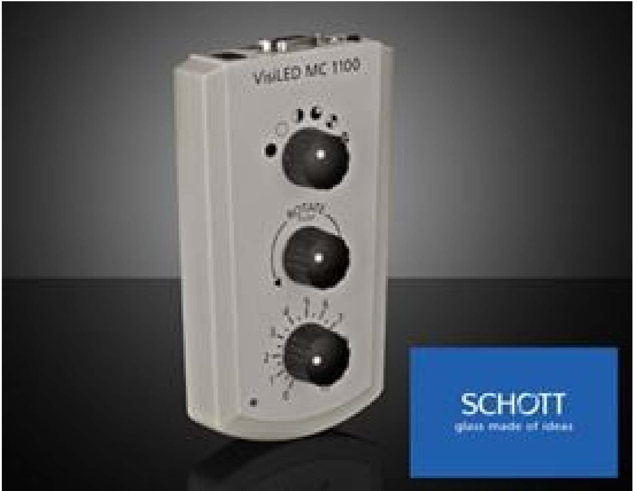
MC 1100, Multifunction Controller, #16-790