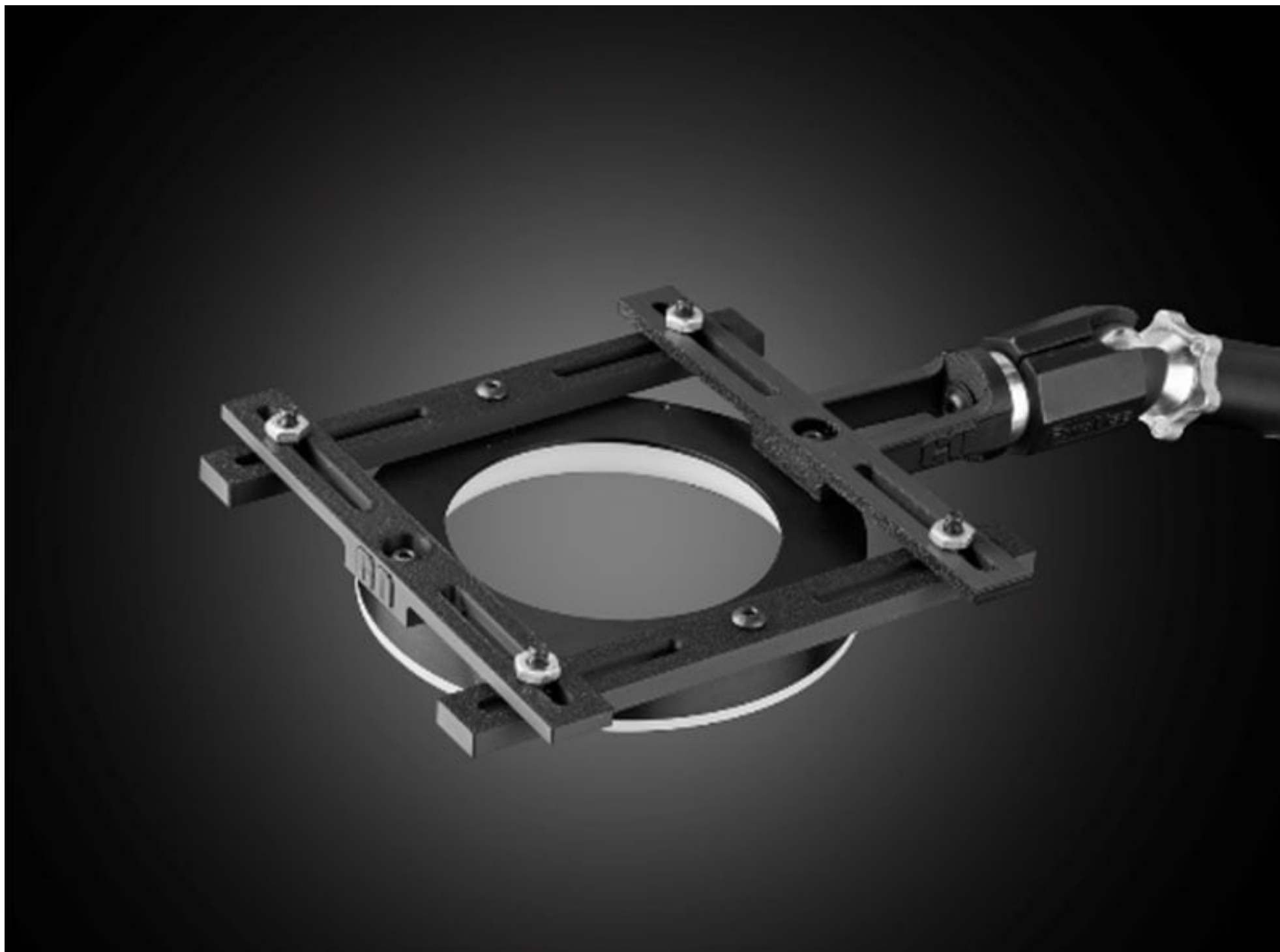
Ring Light Configuration