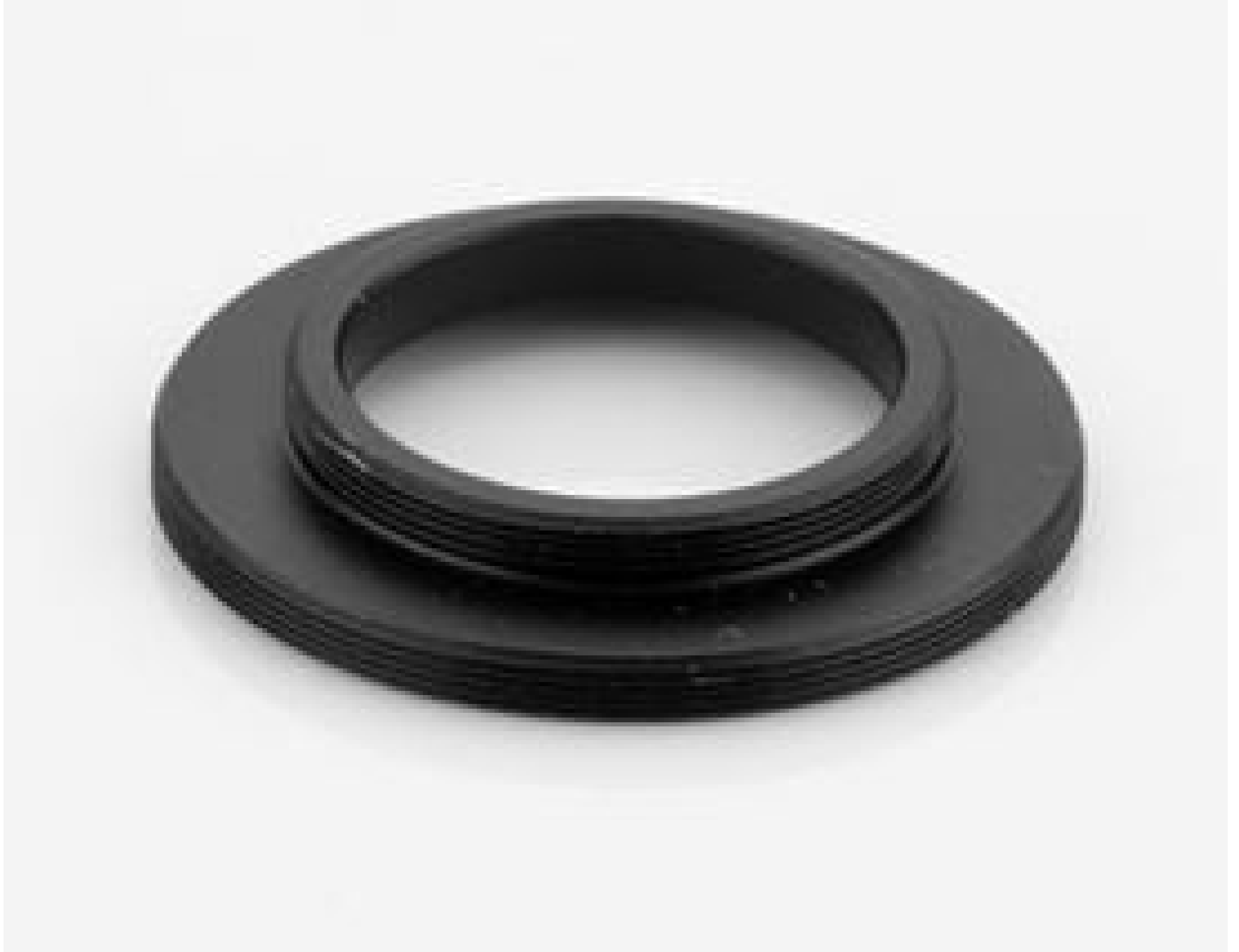
#88-494: M35.5 x 0.5 to M25.5 x 0.5 Adapter