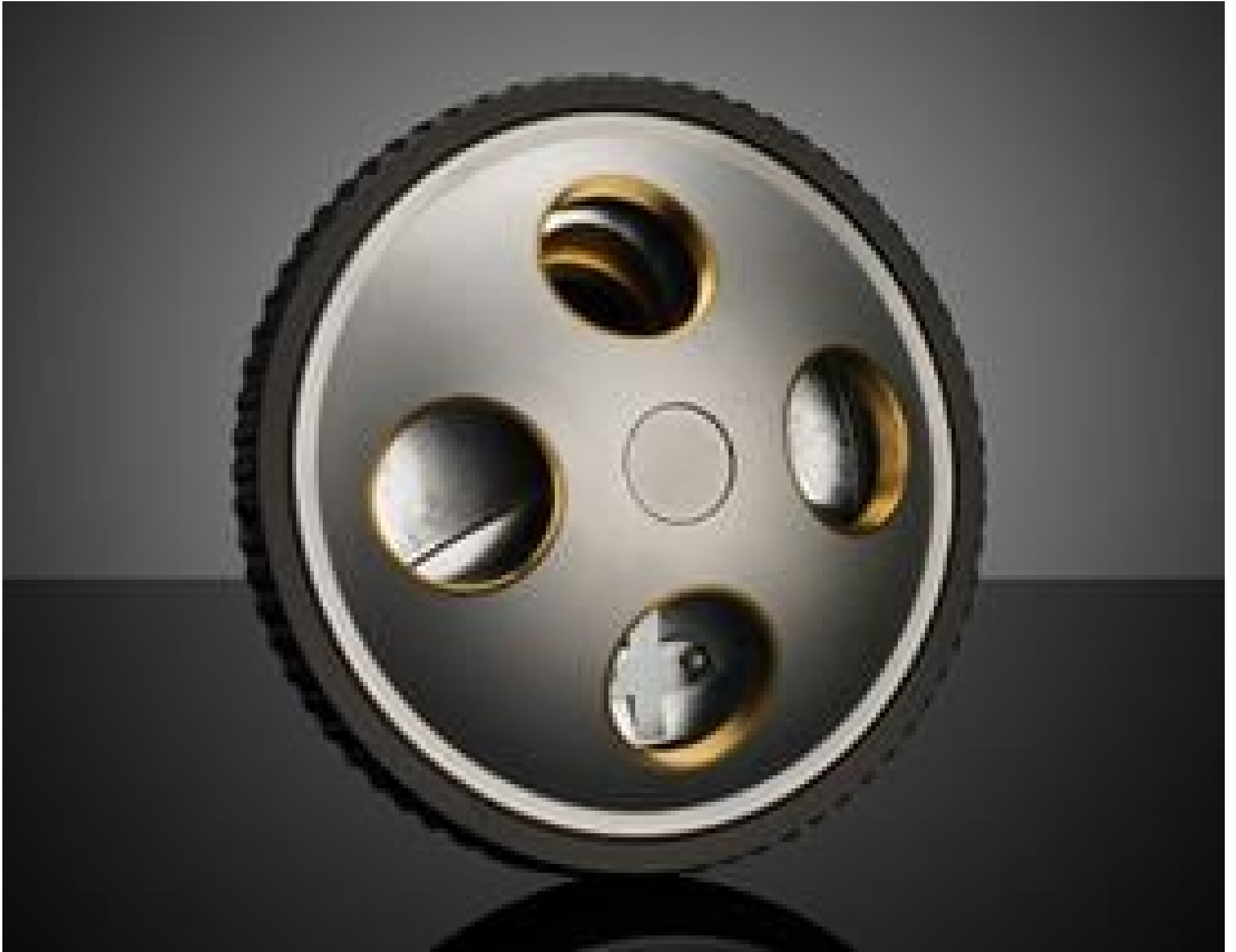
C-Mount Manual Objective Turrets