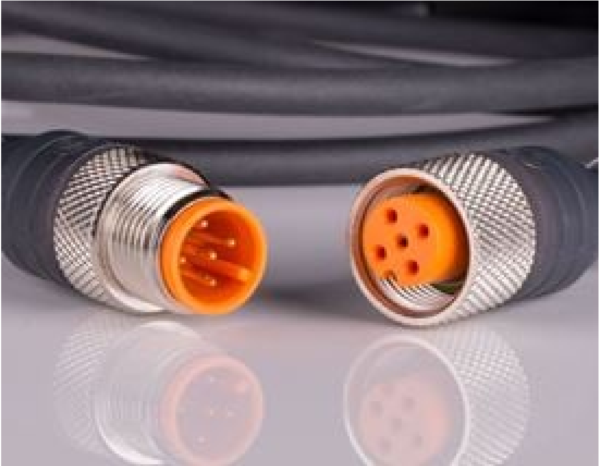
M12 Female to Male, 5 pin, 2m, #34-869