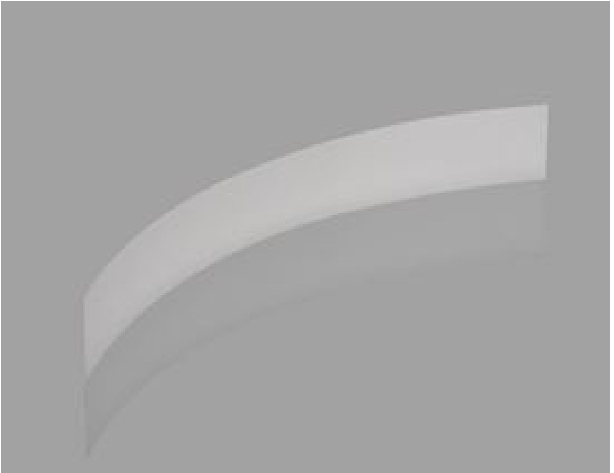
#34-887: Linescan Diffuser Accessory for 15 LED Bar Light