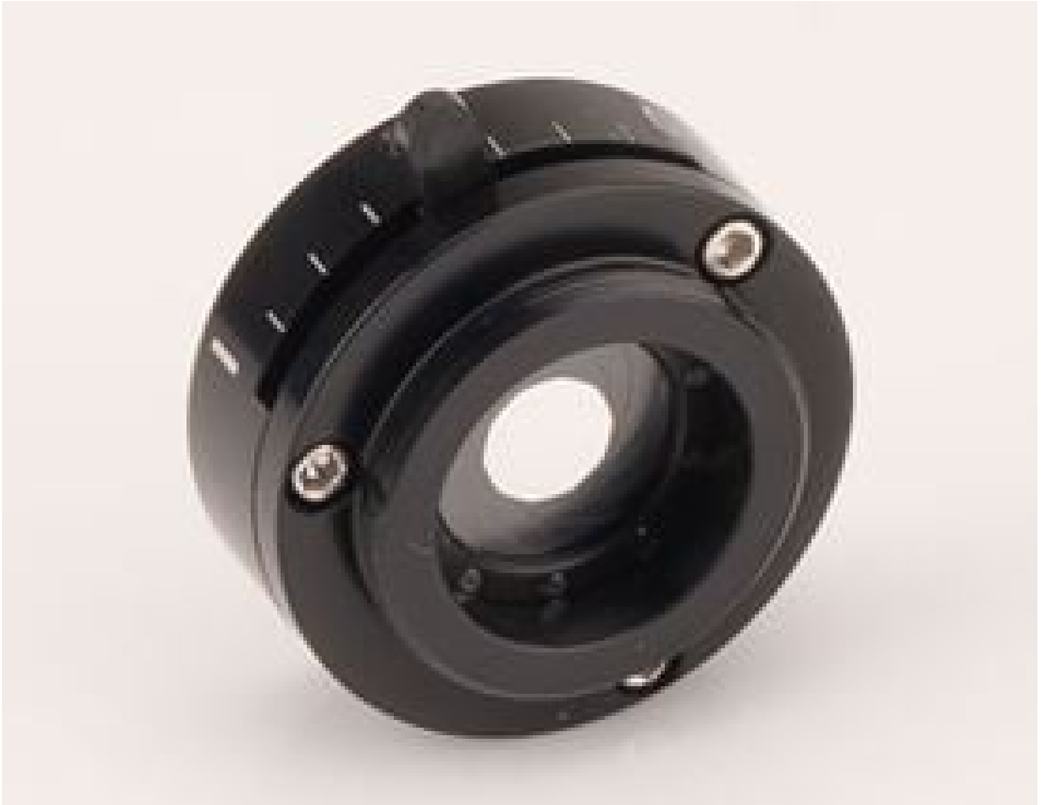
#53-789: KC Iris Diaphragm