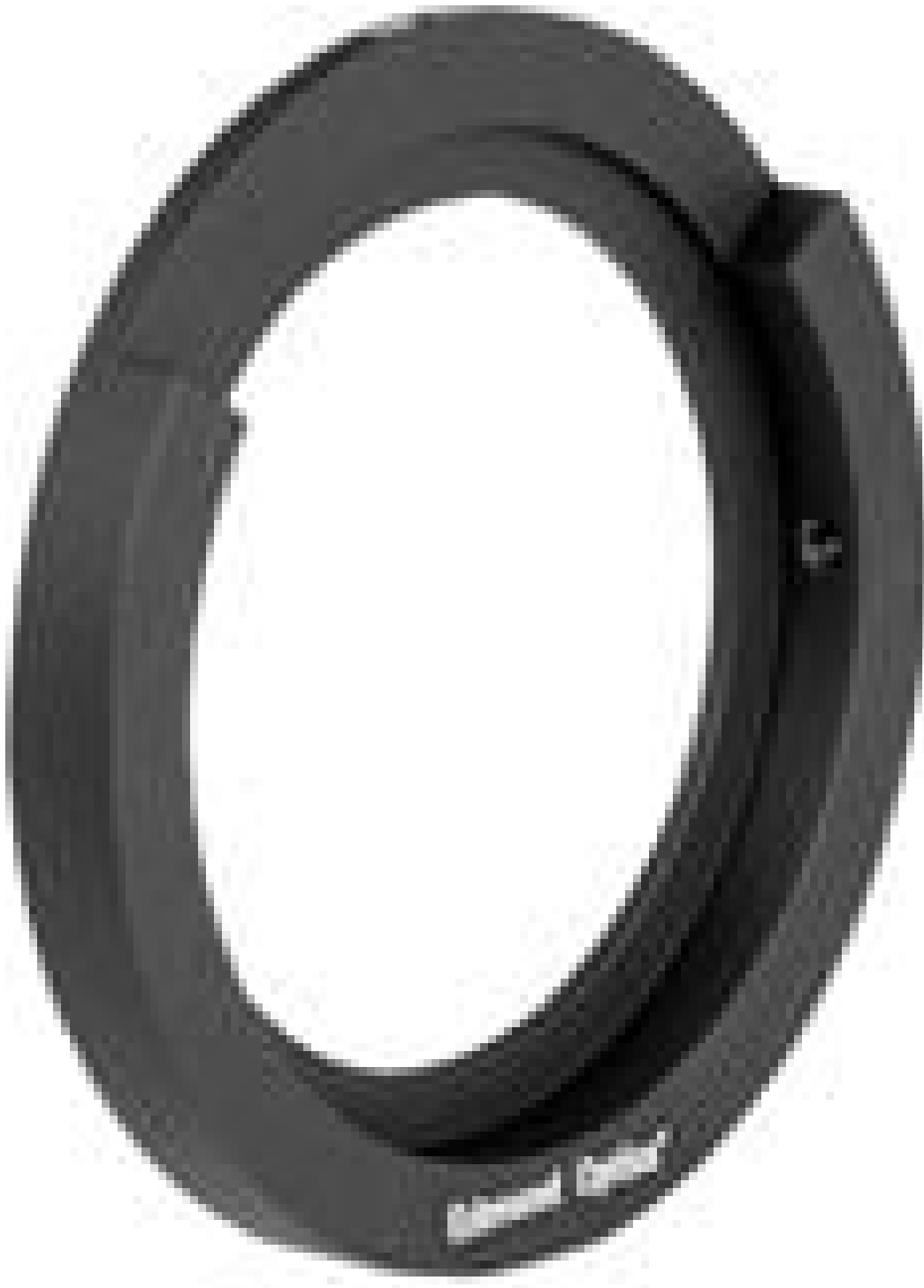
Iris Mount for 70mm Outer Diameter Irises, #53-921