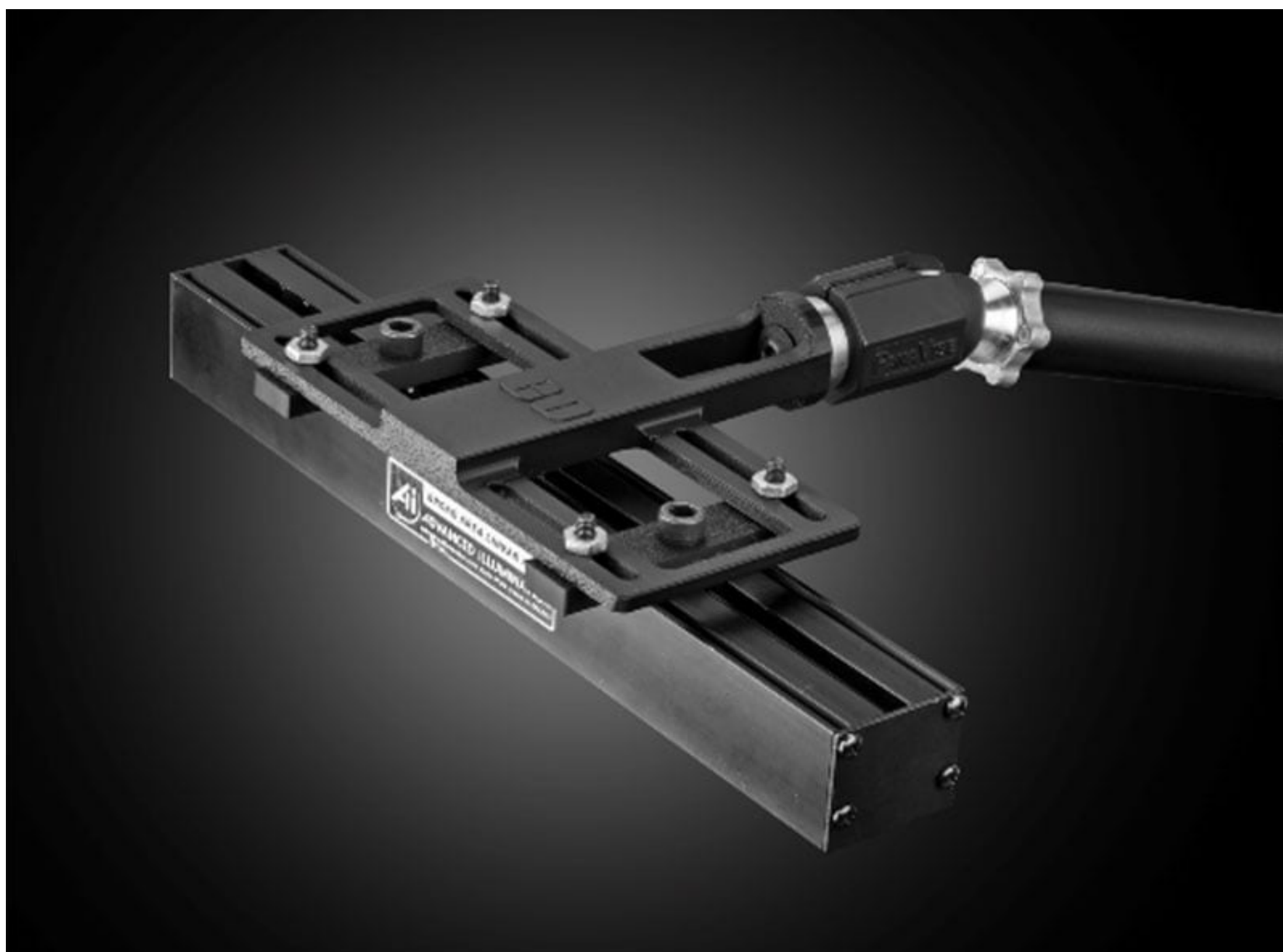
Bar or Line Light Configuration