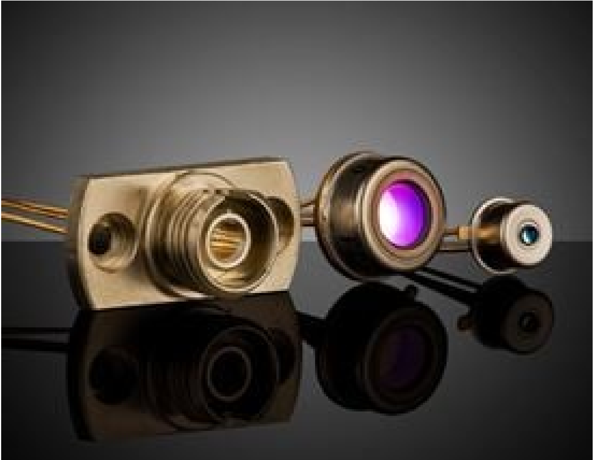
InGaAs Photodiodes (FC Receptacle , TO-5, TO-46)