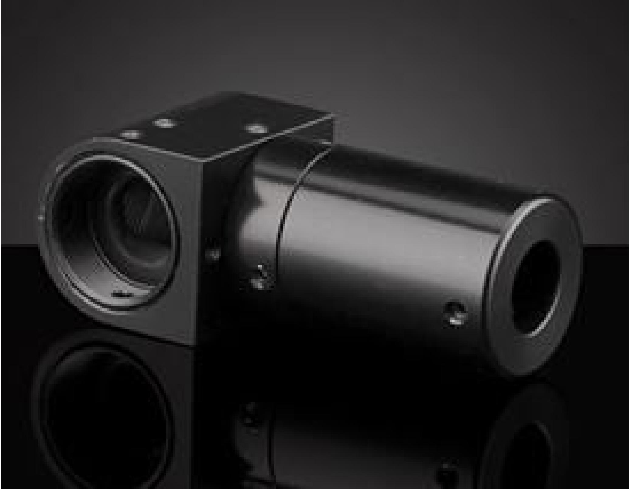
InfiniTube FM In-Line Attachment, +10X Objectives, #58-312

See More by Infinity Photo-Optical Company