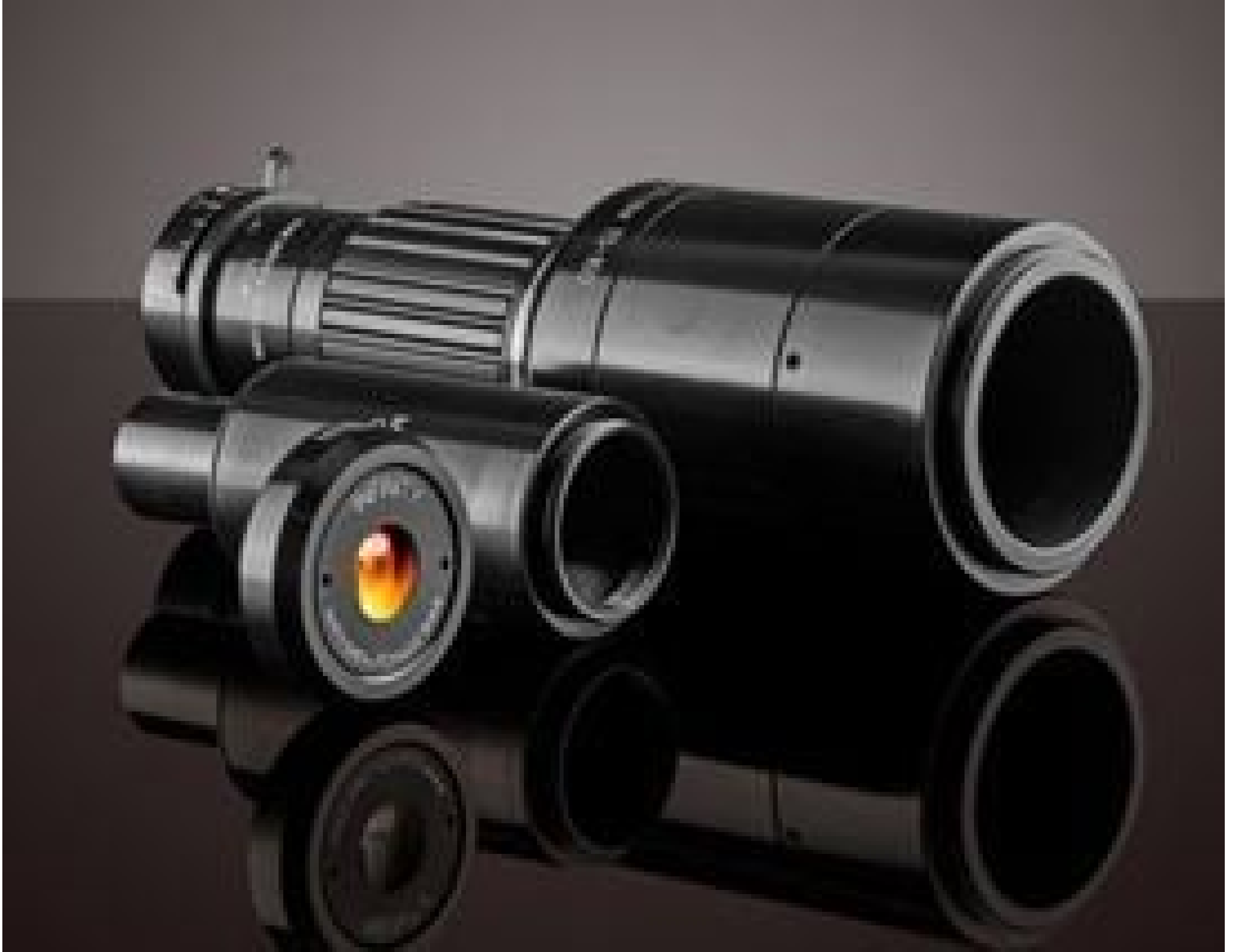
InfiniProbe TS-160, #34-715

See More by Infinity Photo-Optical Company