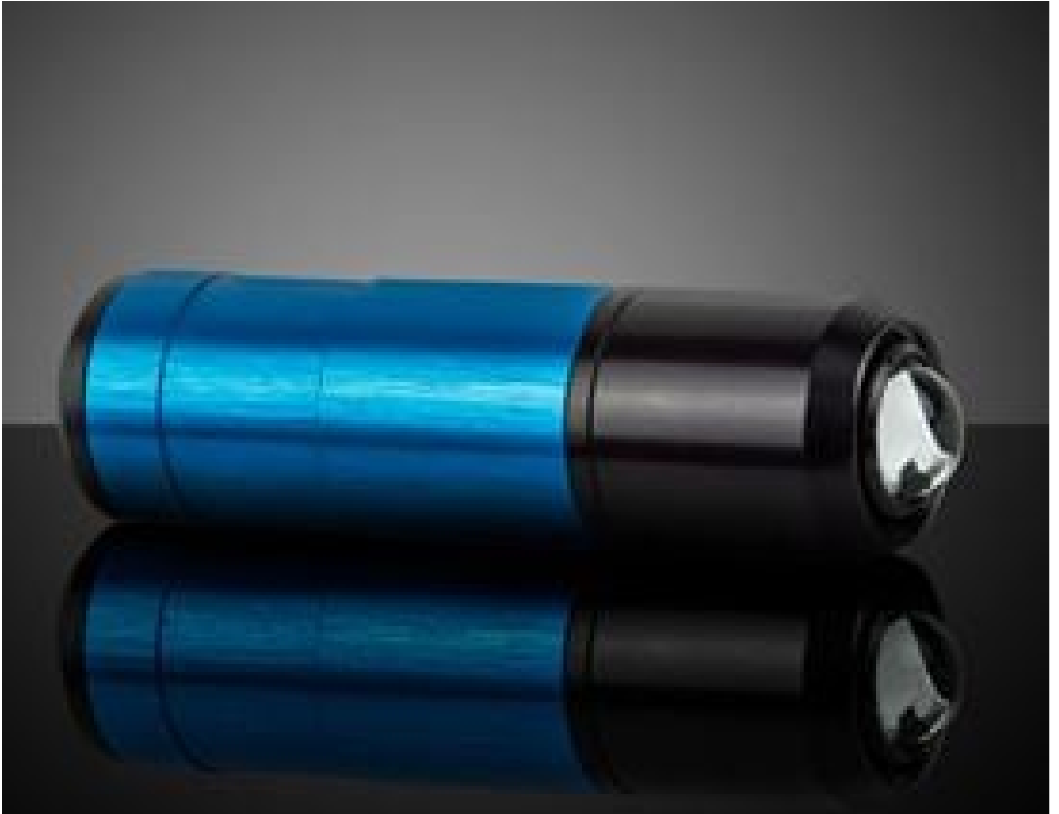
Premier Laser Diode Detector