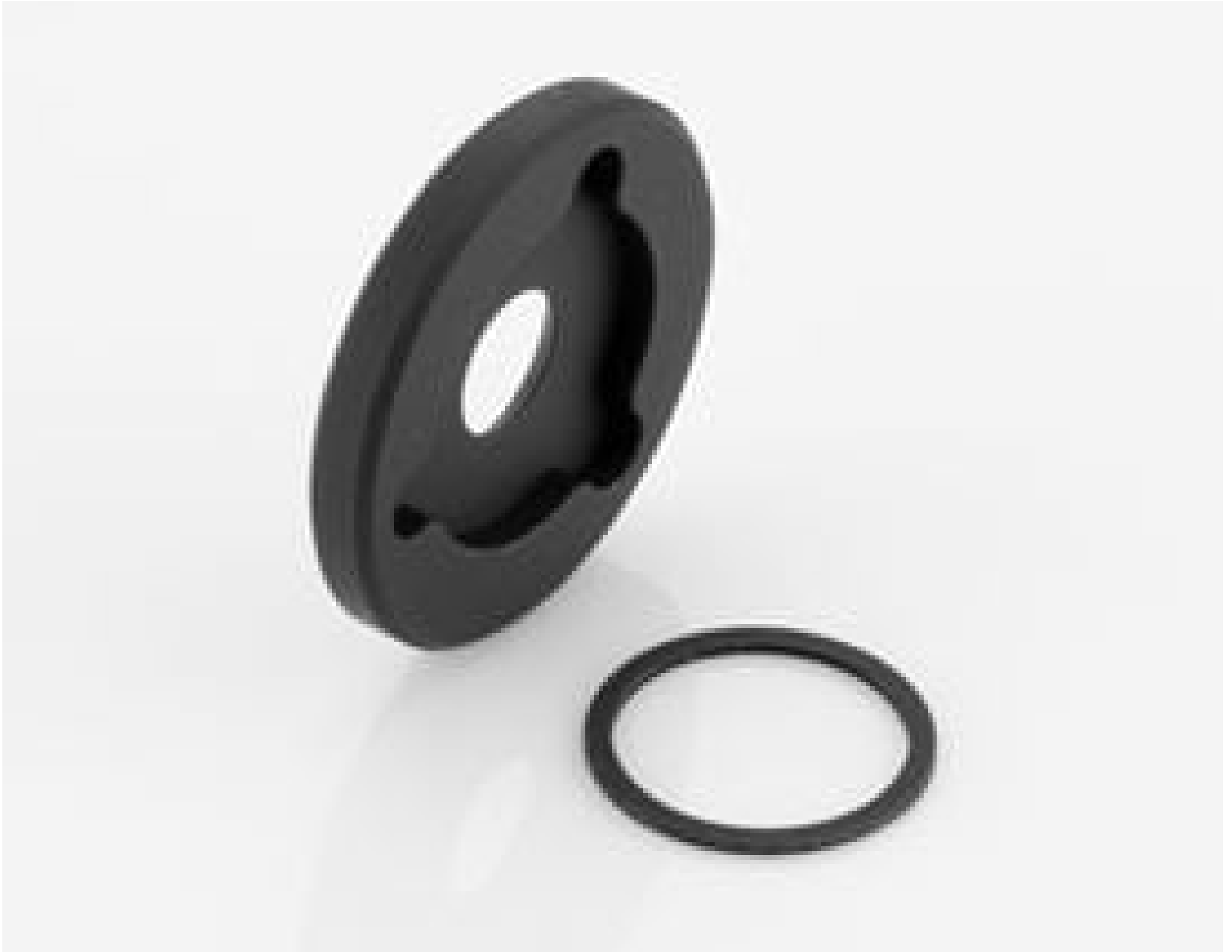
Filter Holder for Cx lens