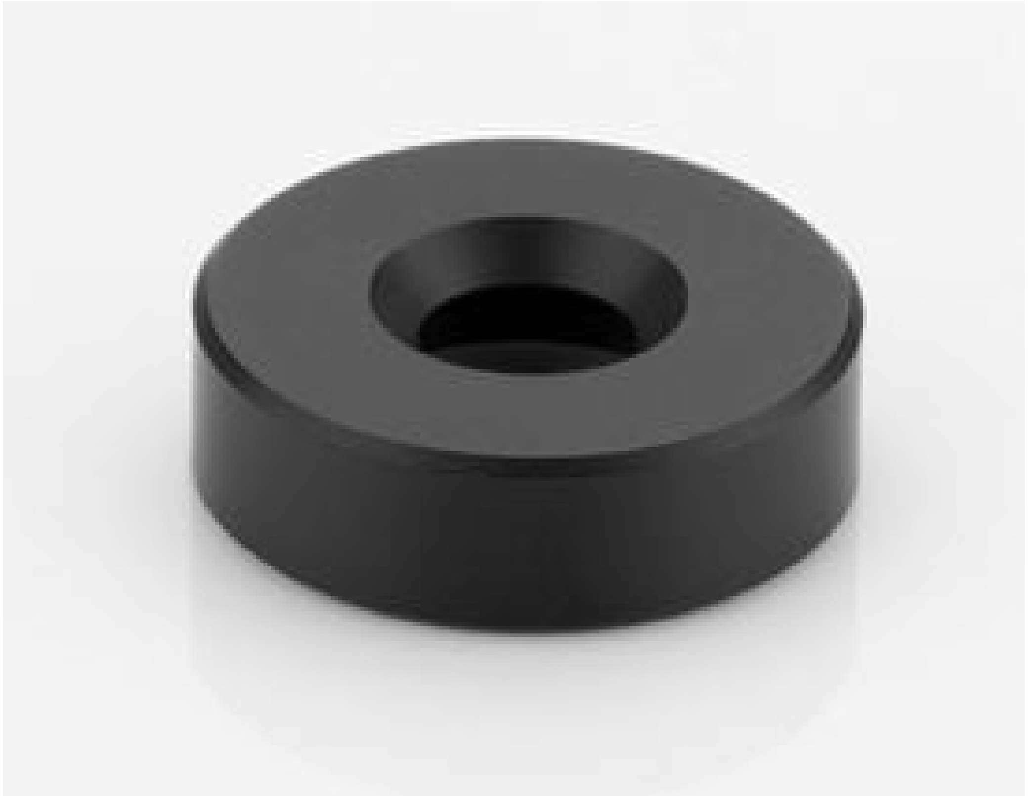
Filter Holder for 50mm Cx Lens (representative photo). Filter Holder varies by stock number. View PDF drawing for additional information.