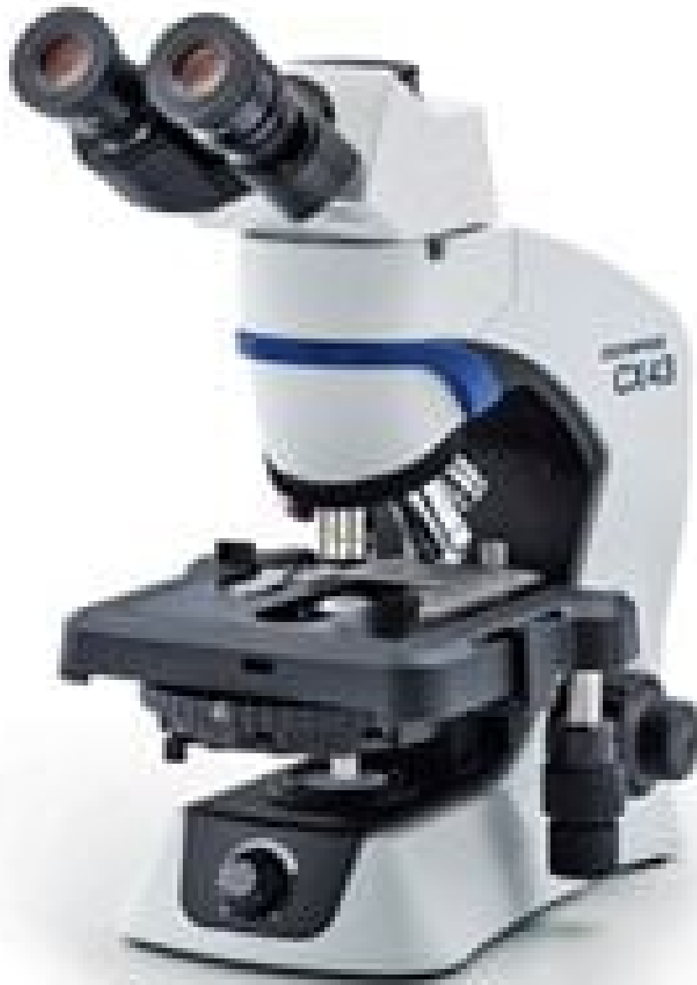
Image shown is full assembly. Each component sold separately. See Technical Information tab for additional details.