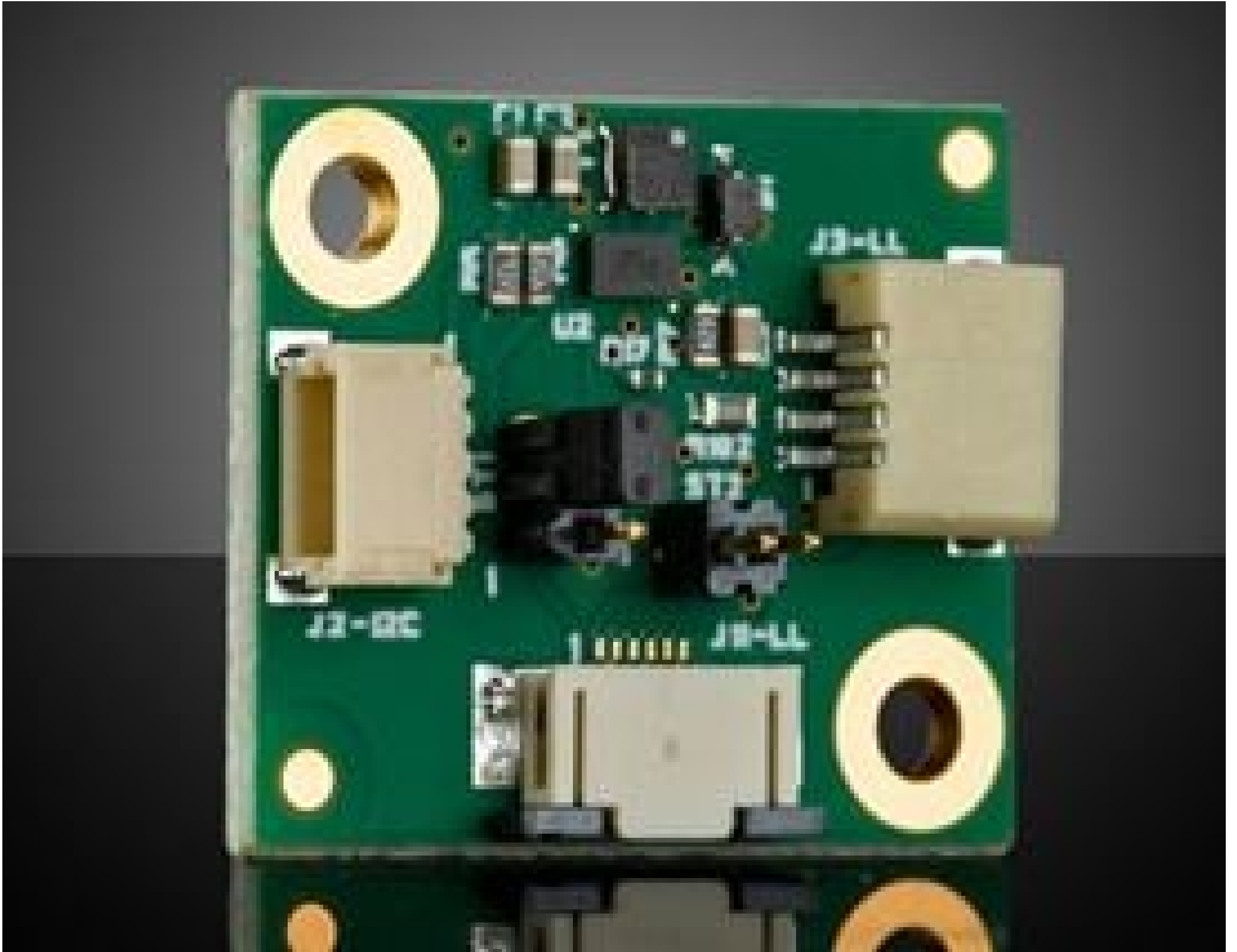
Corning® Varioptic® Variable Focus Liquid Lens Driver Board with Maxim MAX14574 Driver and I2C/DC Input