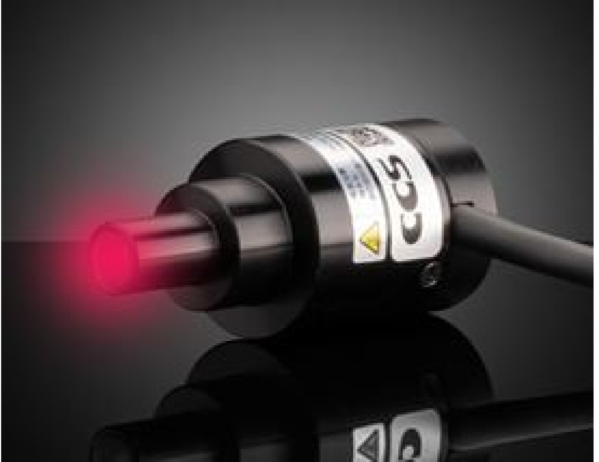
CCS SWIR In-Line Spot Lights