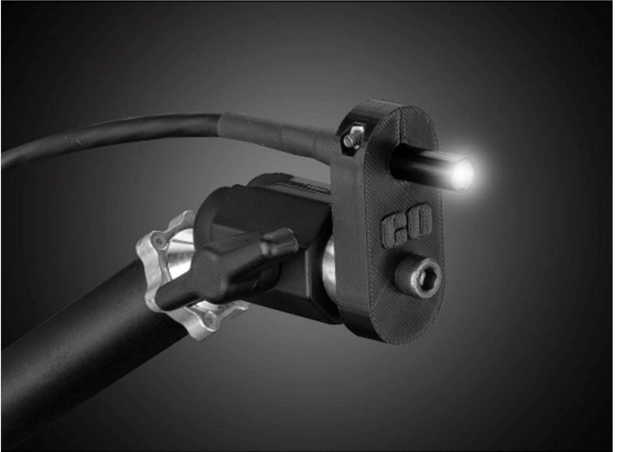
Spot Light Configuration