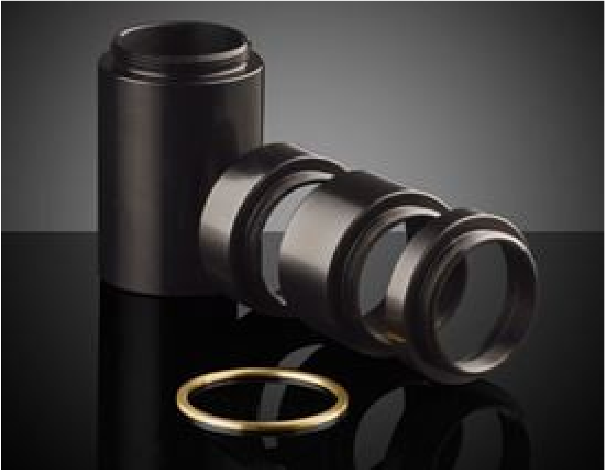
C-Mount Extension Tube Kit, #54-261