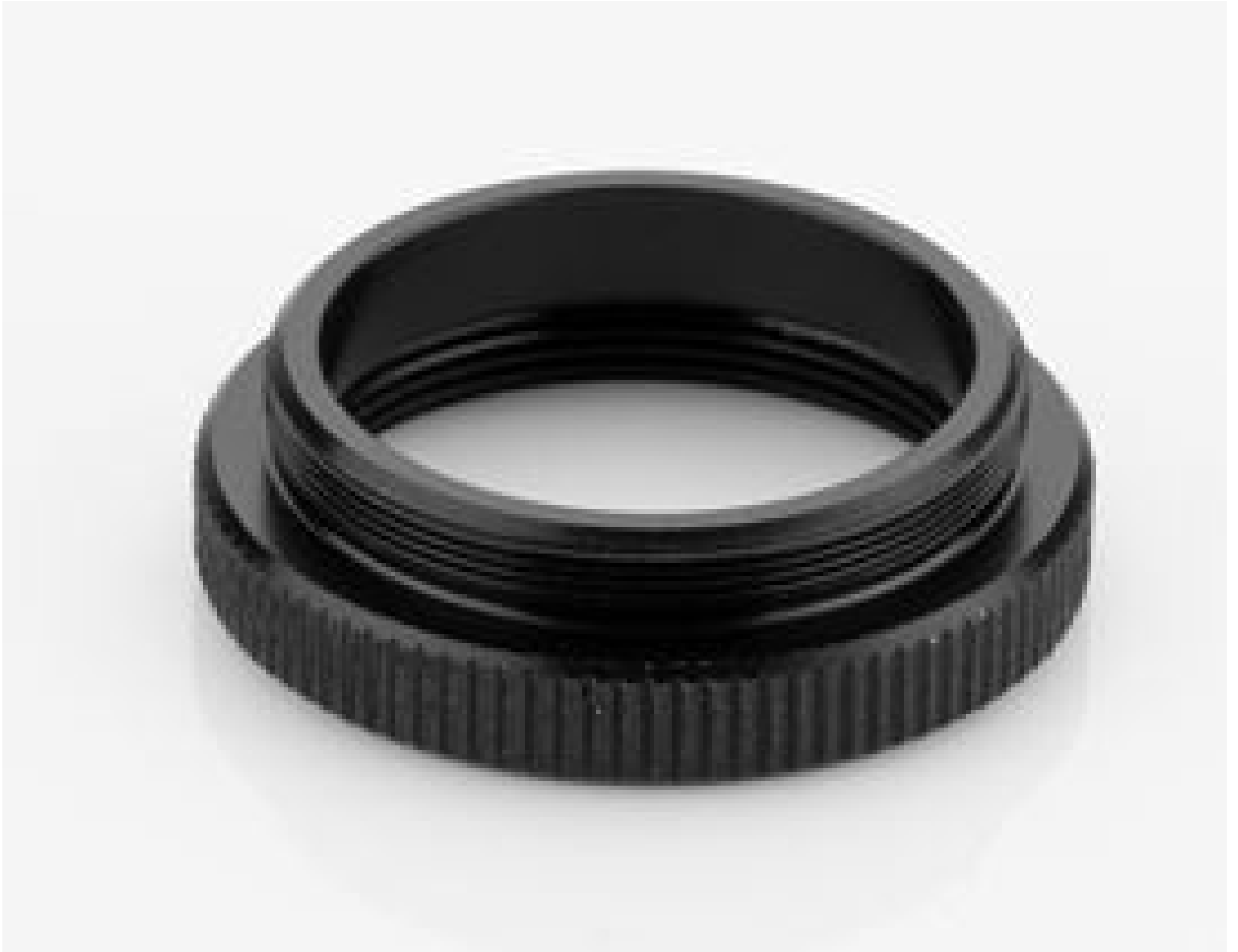
#56-784: C-Mount Adapter for 6 Position Filter Wheel and Assembly