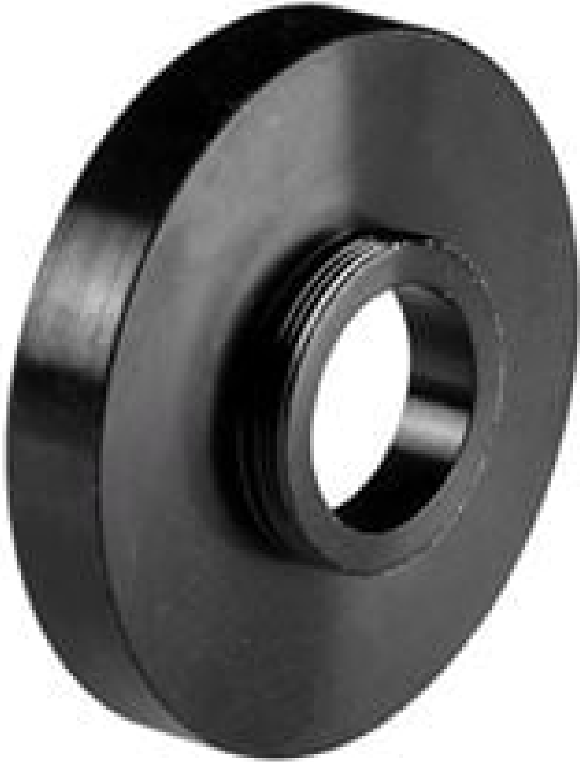
C-Mount Accessory Mount for #47-274, #56-869