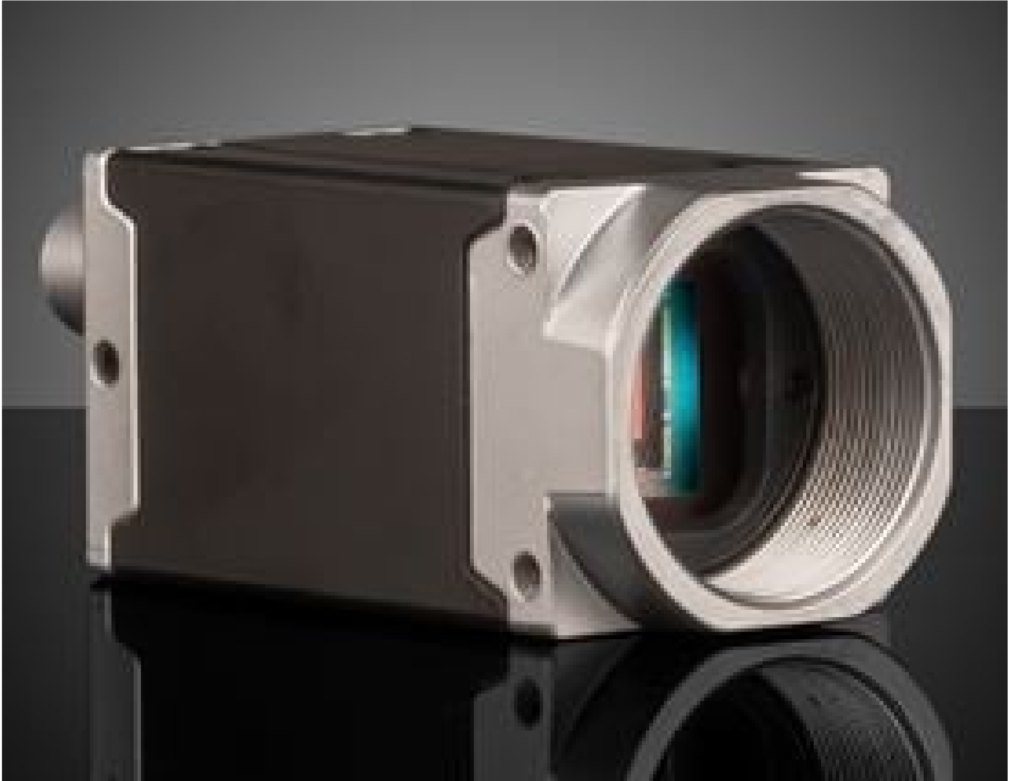
Basler ace2 GigE Cameras (Front)